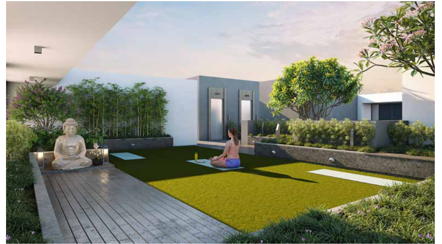
YOGA AREA WITH SUNRISE DECK