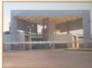
Kharghar Rly. Stn.