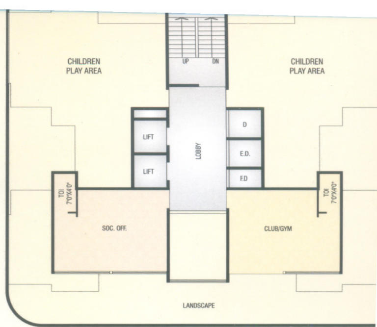
1st Floor Podium Plan