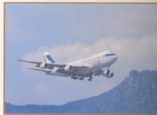
Prop. Inter. Airport