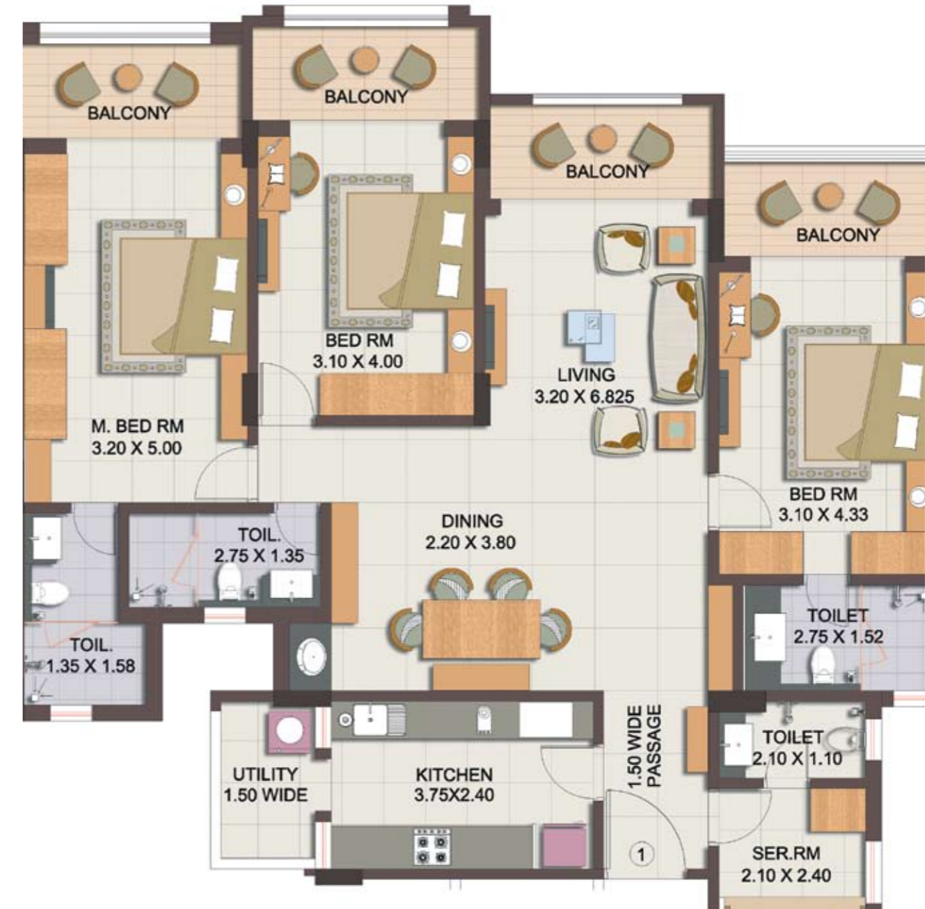
3 Bedroom Residences with Servants Room - La Gomera and La Palma