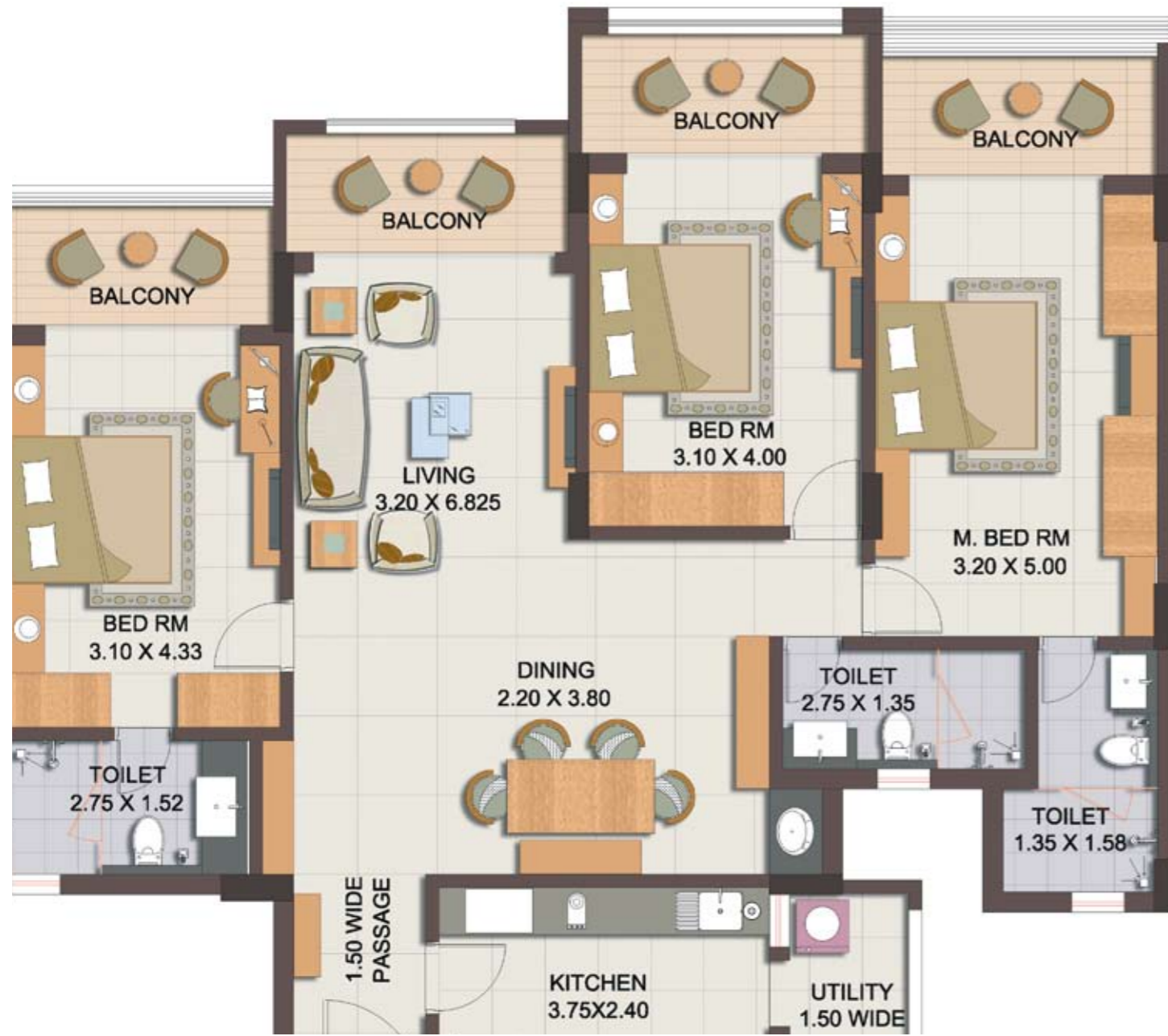
3 Bedroom Residences - La Gomera and La Palma