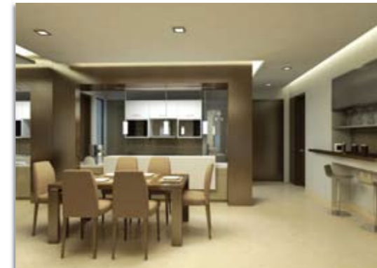
Open Kitchen Concept