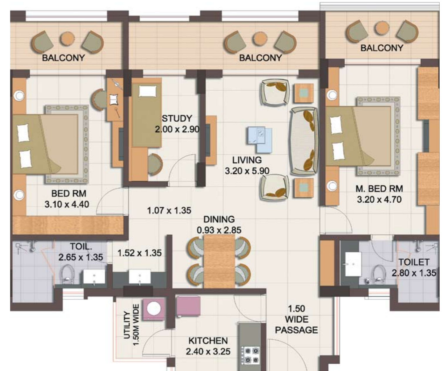
2 Bedroom Residences with Study Room - Boa Vista