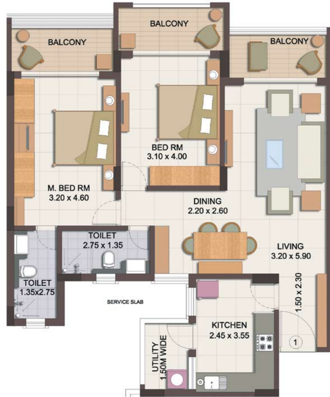
2 Bedroom Residences - Azores, Flores, Corvo and Gran Canaria.