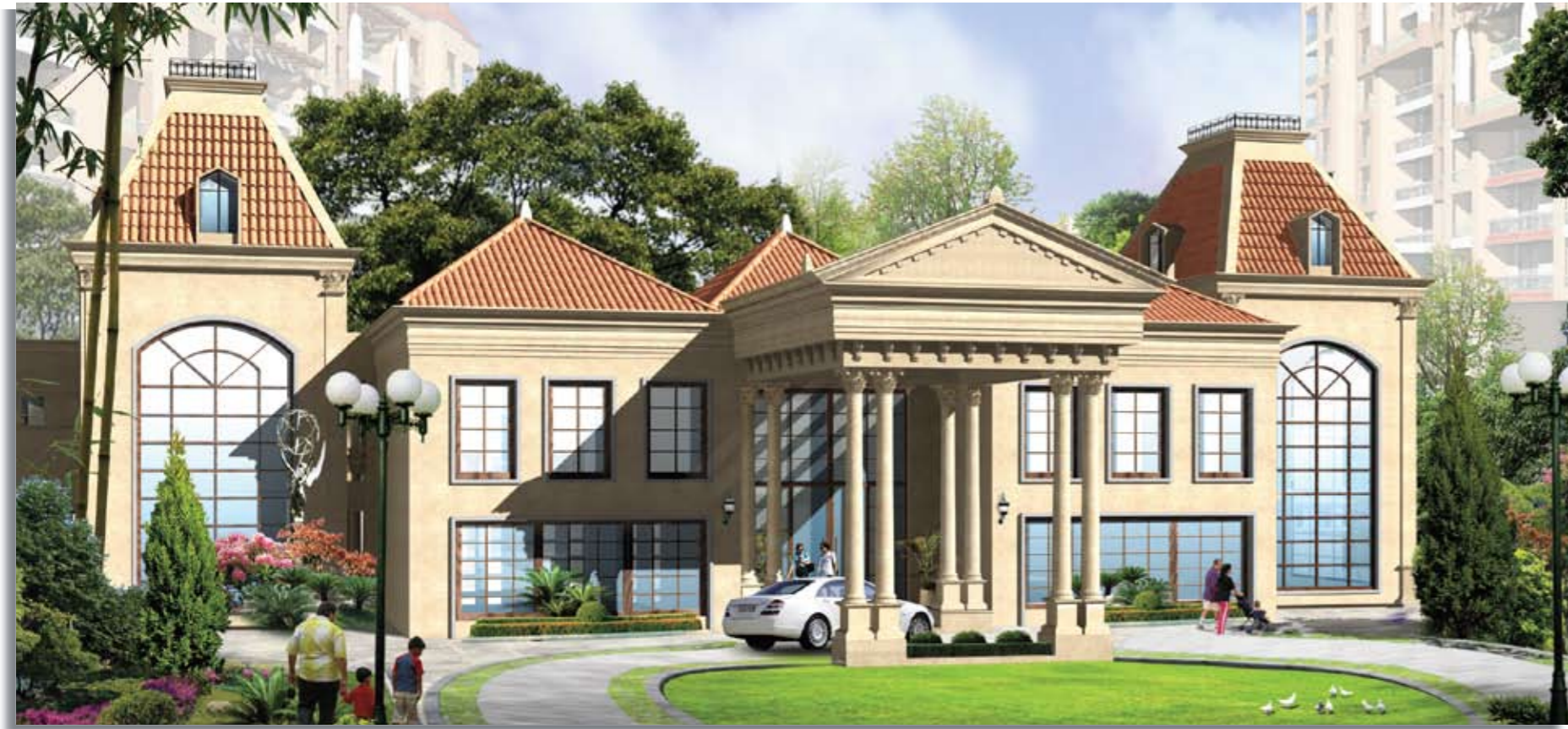
Front view of the clubhouse