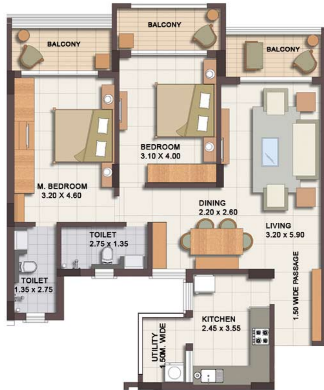
2 Bedroom Residences - Azores, Flores, Corvo and Gran Canaria.