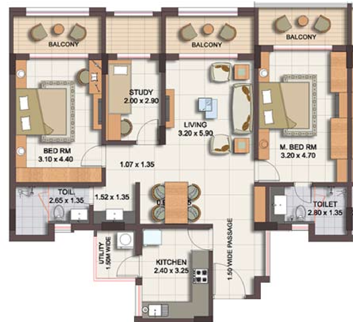
2 Bedroom Residences with Study Room - Boa Vista