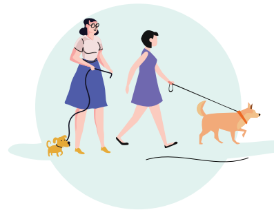
DOG WALK PARK