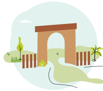
CENTRAL GREEN BOULEVARD

Live amidst the finest amenities in your meticulously designed neighbourhood, be it the integrated green network comprising of a central green boulevard and English-style courts or other world-class amenities like a school and clubhouse. Add to it a police station and a fire station and you know that you are living in a complete ecosystem here.