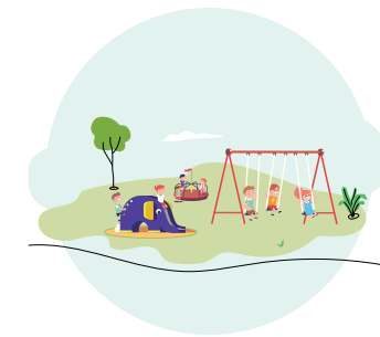
LARGE CHILDREN'S PLAY AREA