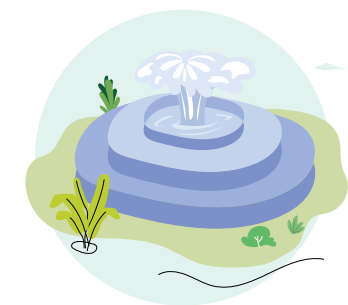
WATER FOUNTAIN & KUND