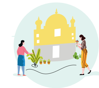
GURUDWARA & WORSHIP HALL