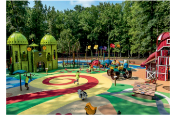
Childrens Play area