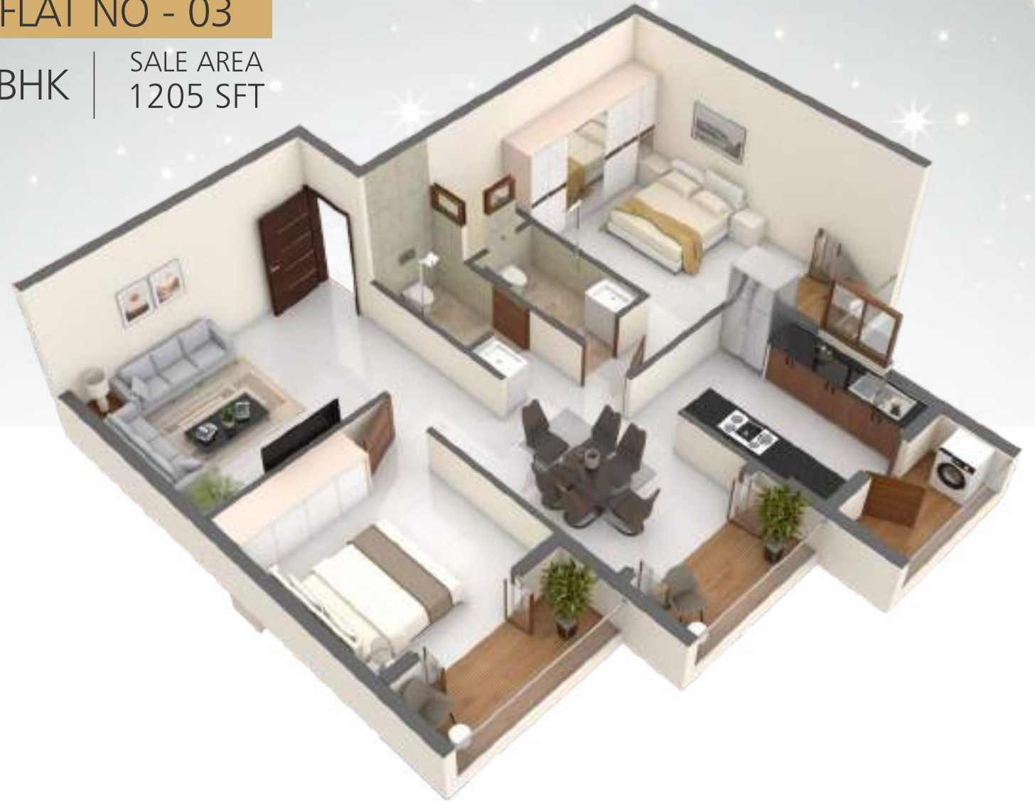
FLAT NO - 03 2 BHK | SALE AREA 1205 SFT