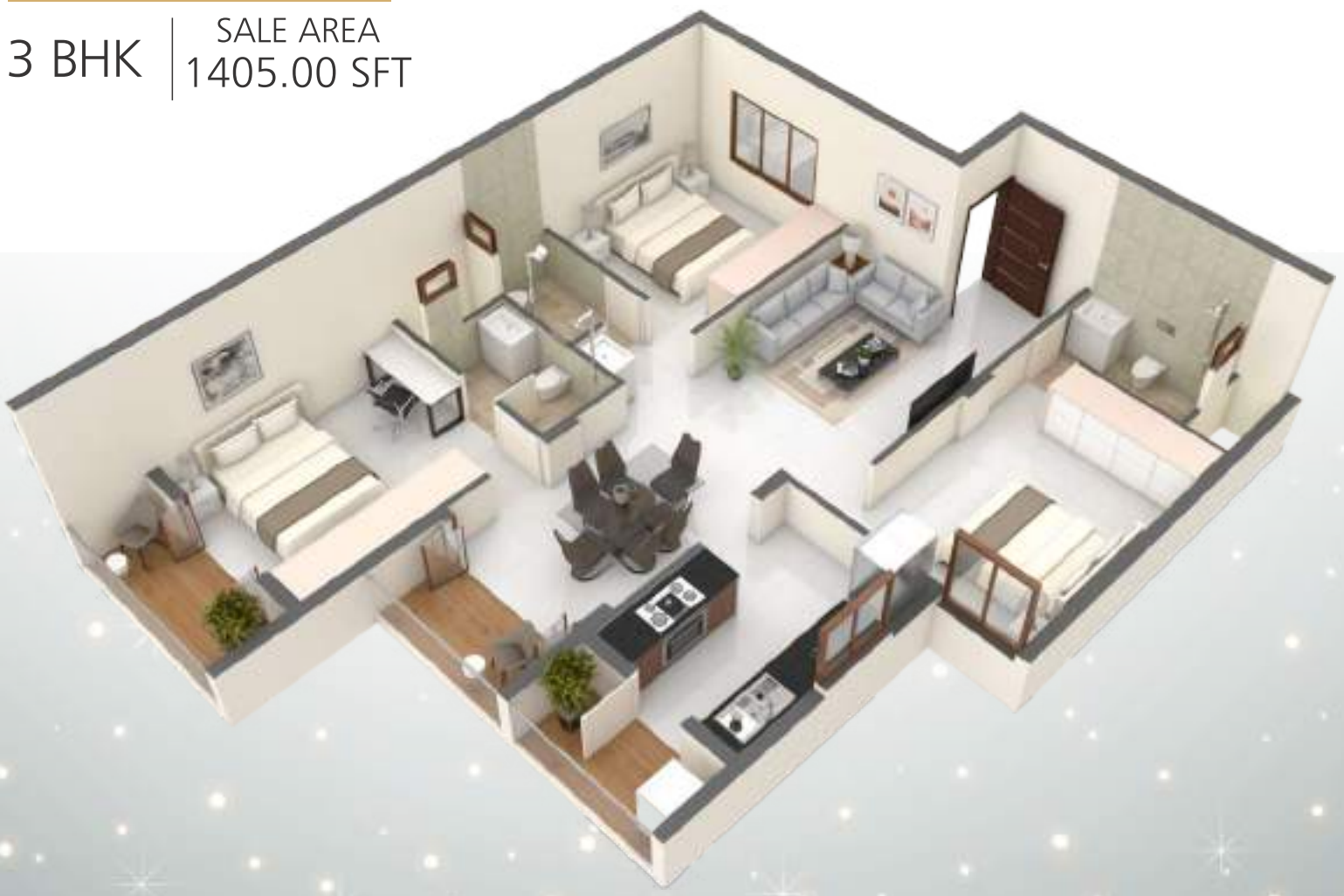
FLAT NO - 02 3 BHK | SALE AREA 1405.00 SFT