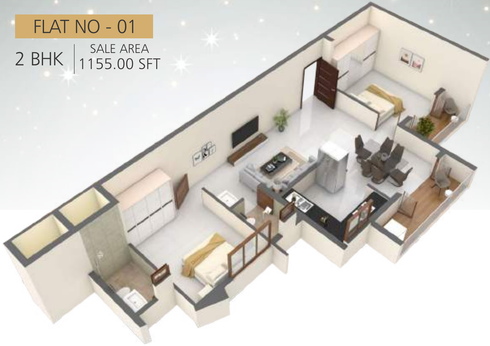
FLAT NO - 01 2 BHK | SALE AREA 1155.00 SFT