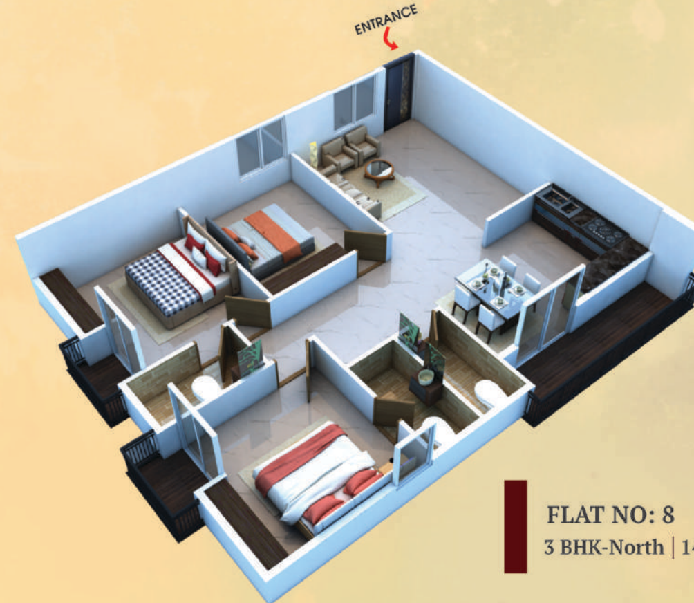
FLAT NO: 8 3 BHK-North | 1458 SFT