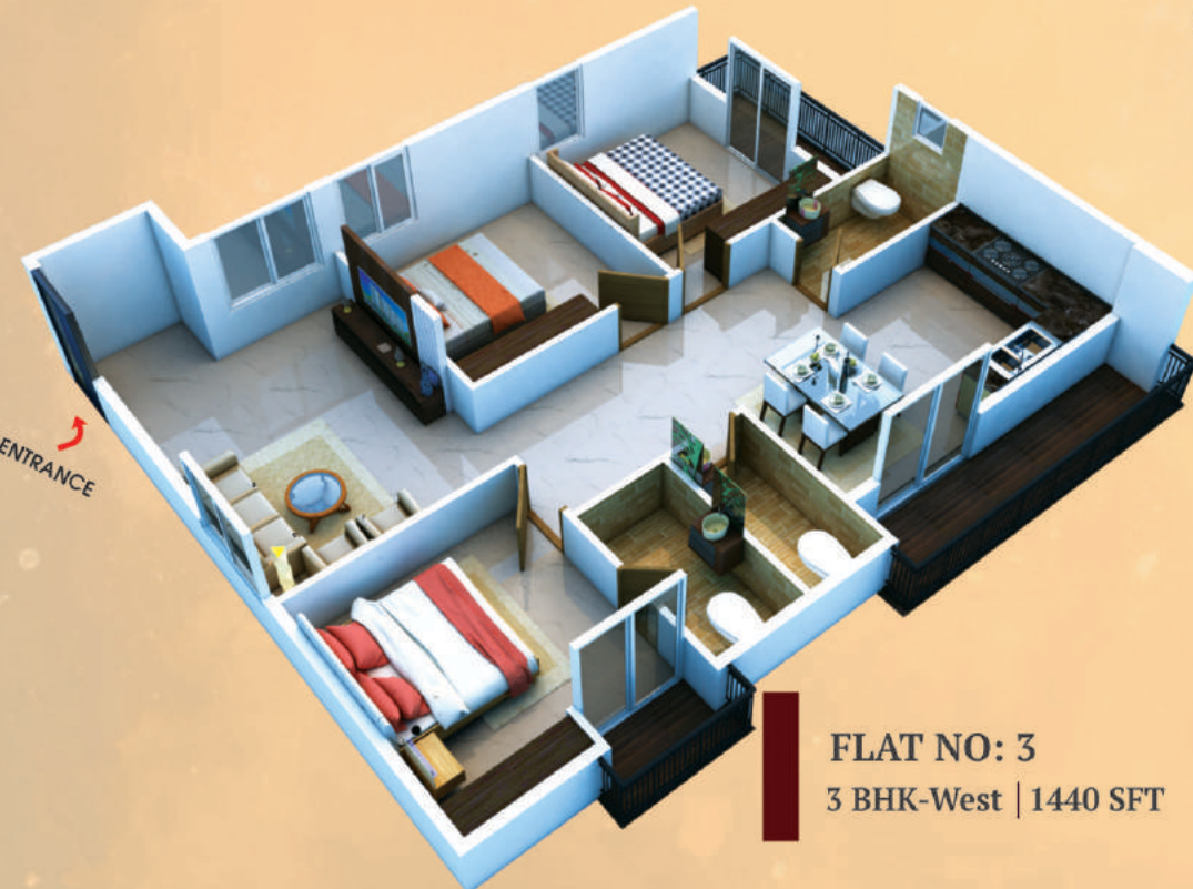
FLAT NO: 3 3 BHK-West | 1440 SFT