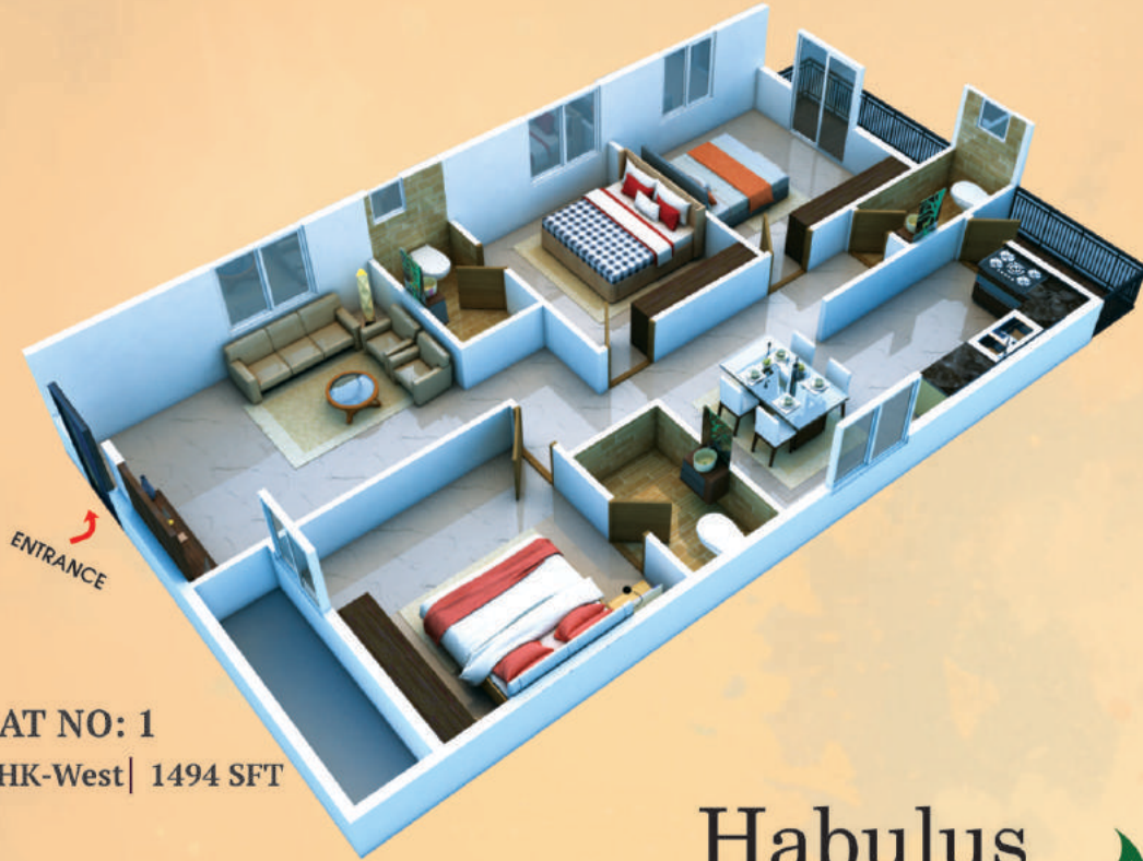
FLAT NO: 1 3 BHK-West | 1494 SFT