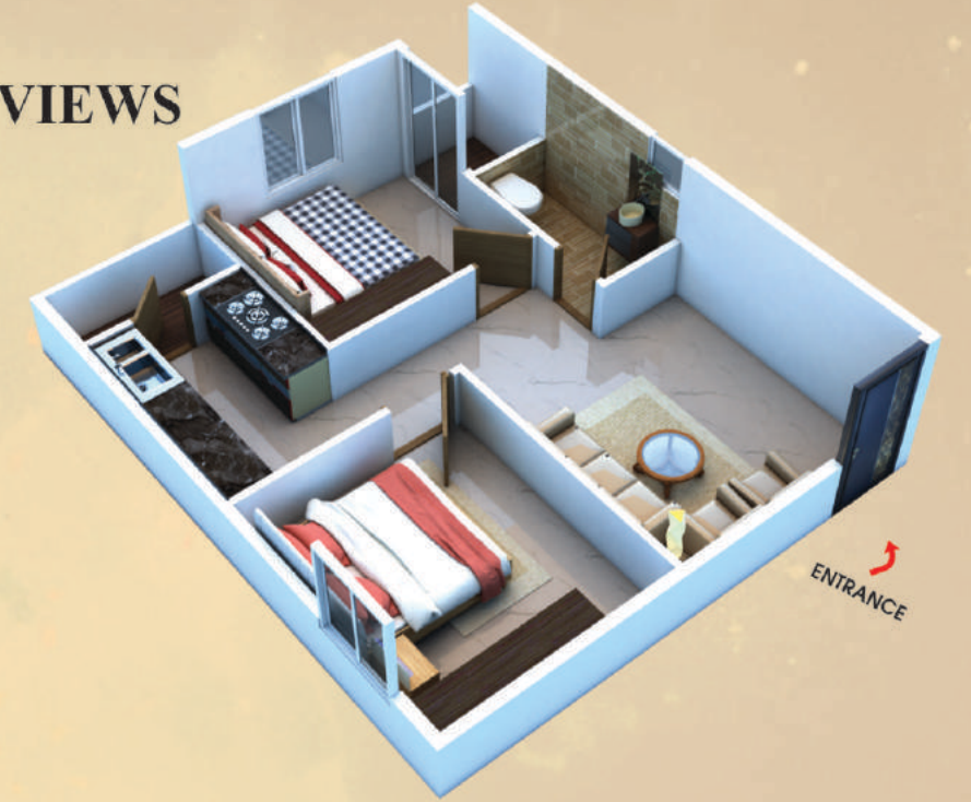
FLAT NO: 6 2 BHK-South | 792 SFT