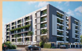
Sri Sai Uphara Restaurant