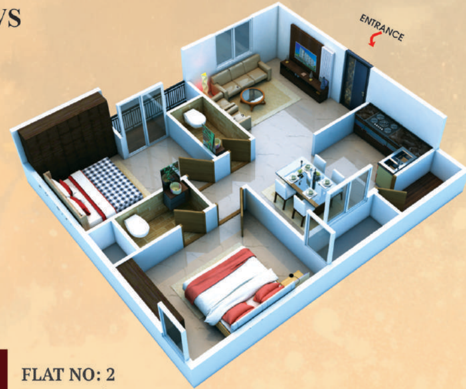
FLAT NO: 2 2 BHK-East | 1053 SFT