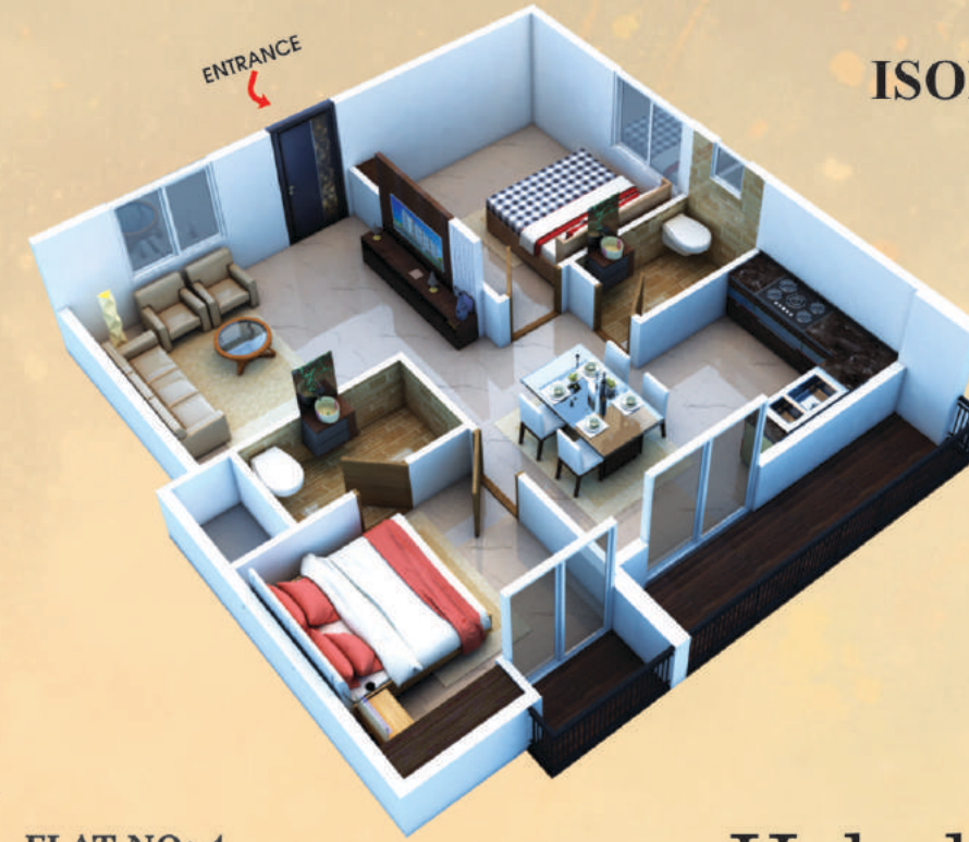
FLAT NO: 4 2 BHK-North | 1152 SFT