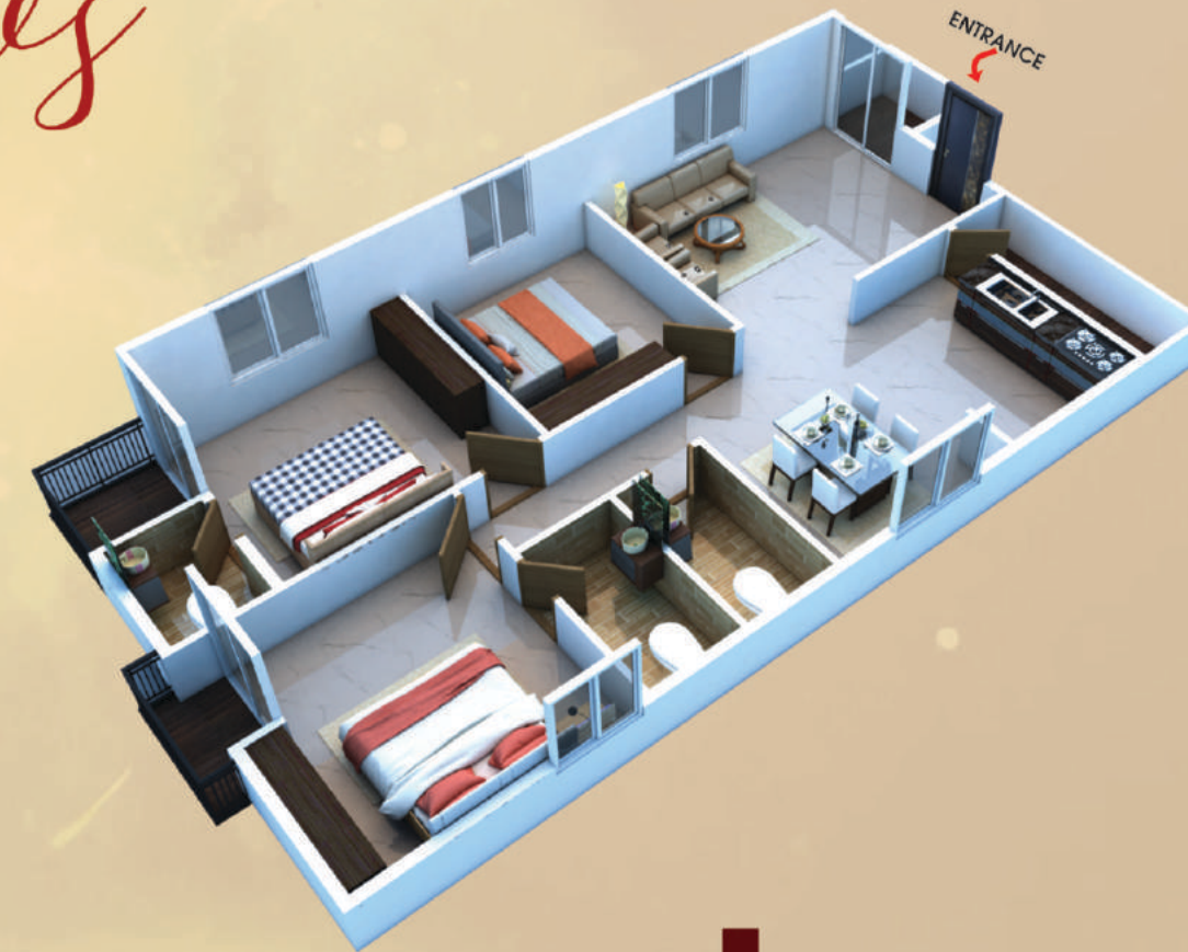
FLAT NO: 9 3 BHK-East | 1440 SFT