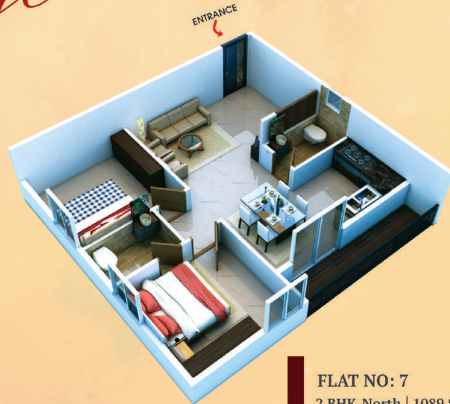
FLAT NO: 7 2 BHK-North | 1089 SFT