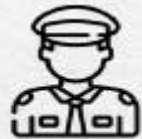
24x7 Security Surveillance