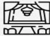
Banquet / Multipurpose Hall