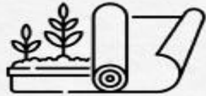
Terrace Garden with Yoga Deck