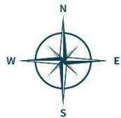
NORTH FACING - TERRACE FLOOR PLAN