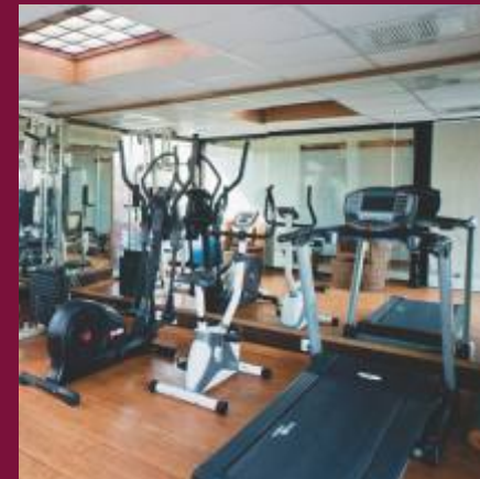
Clubhouse & Gym