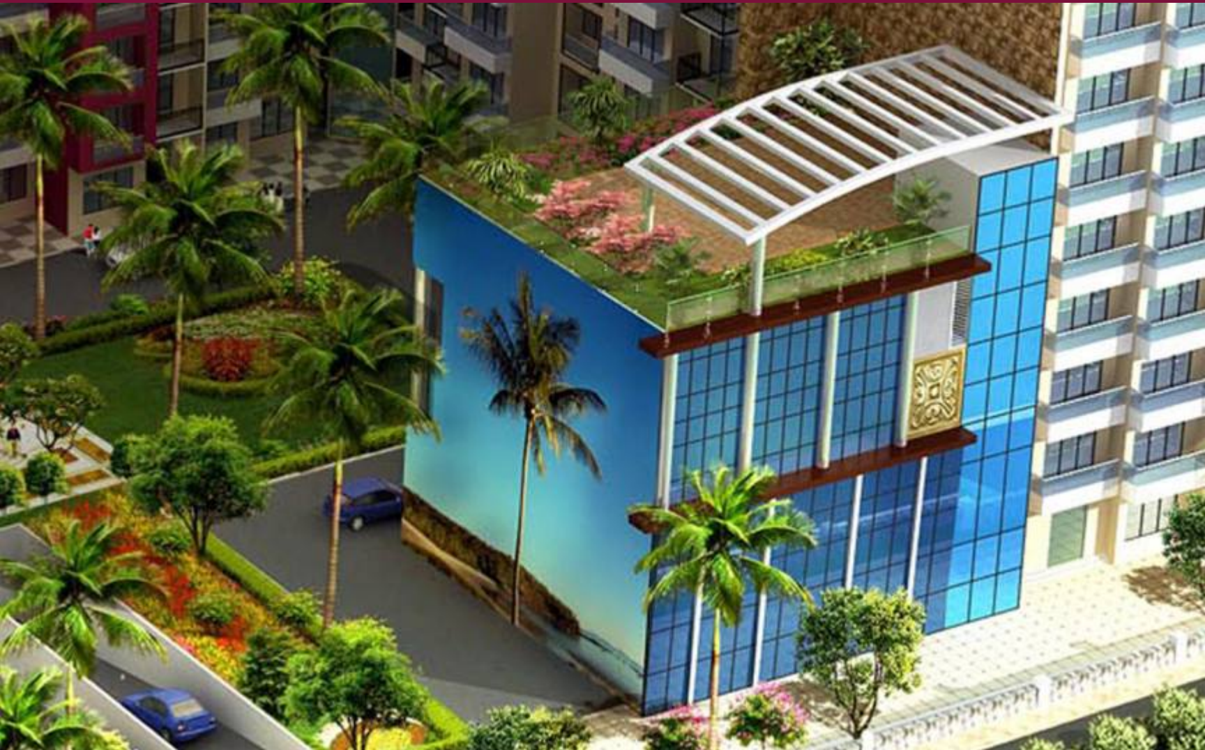
Clubhouse as a part of E Block

Aesthetically designed with the utmost care, Siroya Sunshine is the perfect place for your kids to unwind the feeling of joy and entertainment.