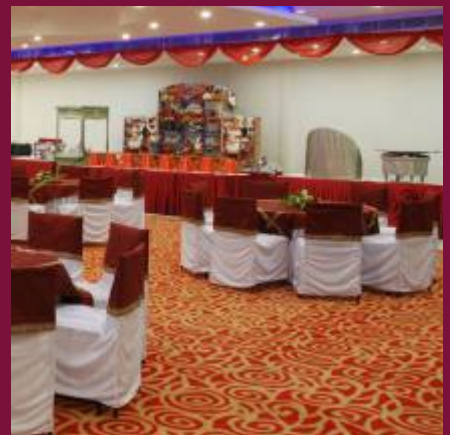
Party Hall with Pantry