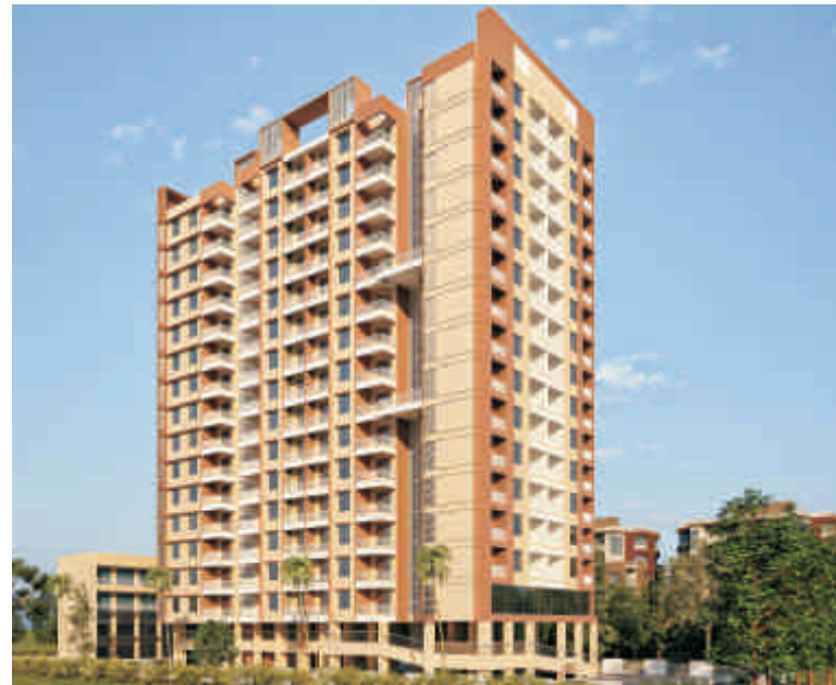
PRIMAL MARIGOLD 2 & 3 BHK Spacious Homes