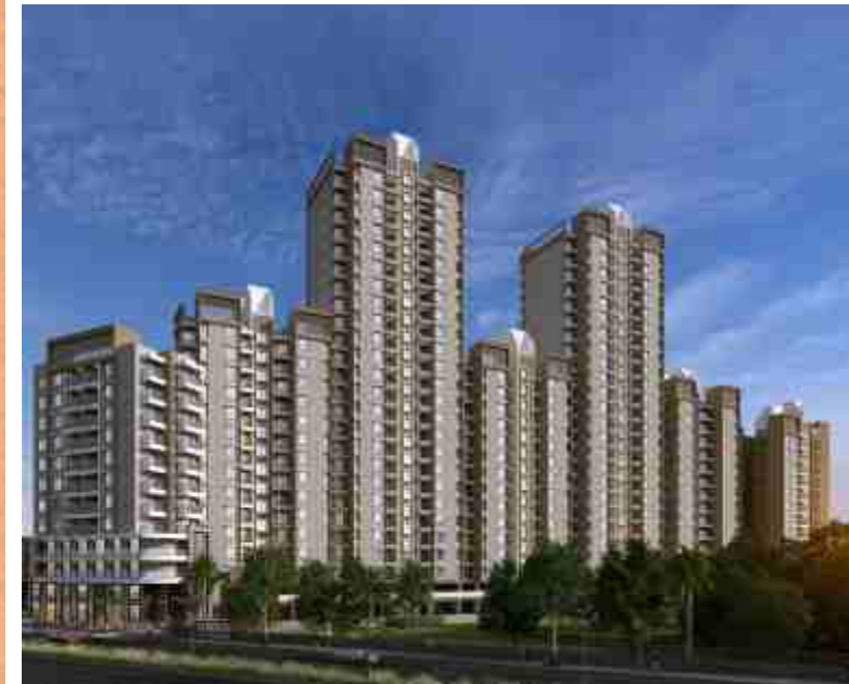
PRIMAL PRIDE 1, 2, 2.5 & 3 BHK Spacious Homes