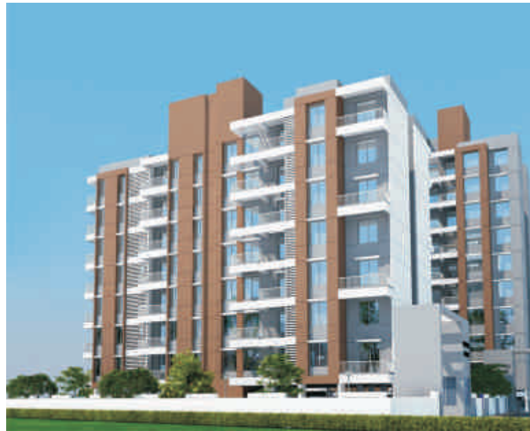
PRIMAL HOMES 1 & 2 BHK Cosy Homes