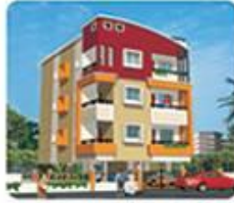
Bhawani Crown Manish Nagar