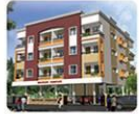
Bhawani Complex Wathoda