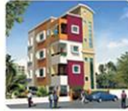
Bhawani Classic Manish Nagar