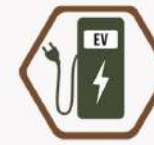
Vehicle Charging point