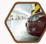
Stilt covered car parking