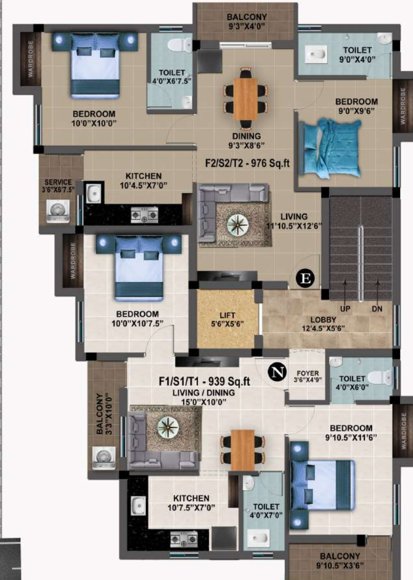
1ST, 2ND & 3RD FLOOR PLAN