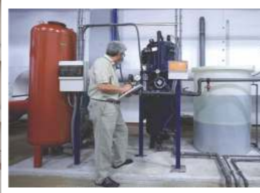
LPG Leakage Detector (Add-on feature)