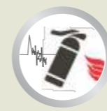
Earthquake & Fire Safety