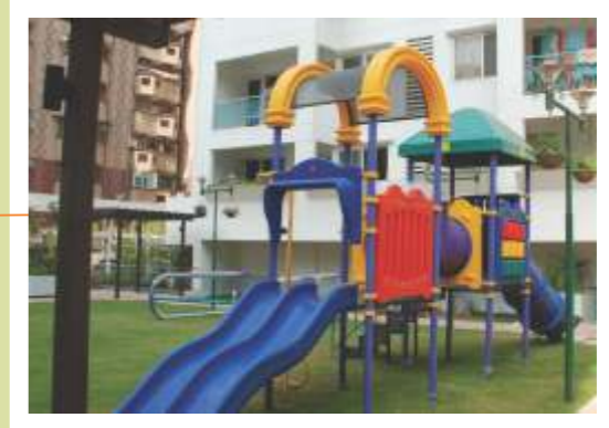
Aesthetically designed children play areas