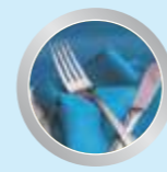
Entertainment & Commercial Hub