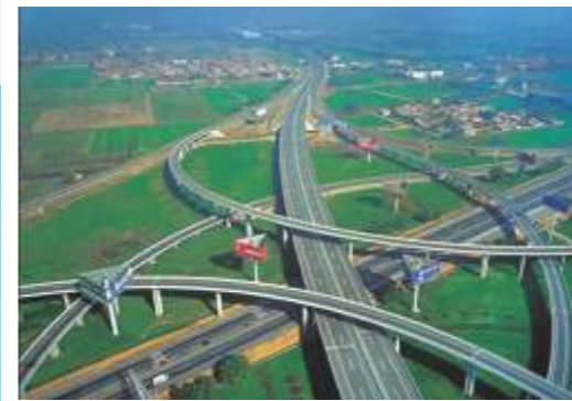
425' wide FNG Expressway being connected to NH-24 and Faridabad