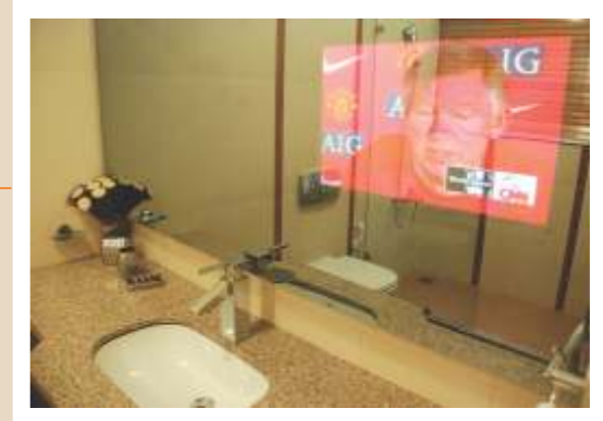
Lavish Bathroom with Mirror TV, (Add-on feature) Designer Tiles & Branded fittings