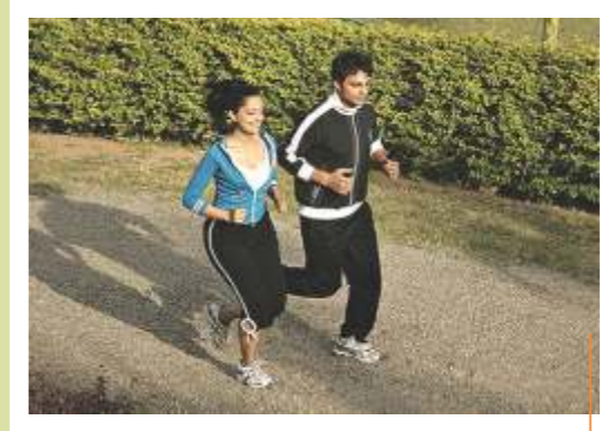
Aesthetically designed intervening jogging tracks