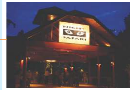
Proposed Night Safari on lines of Singapore