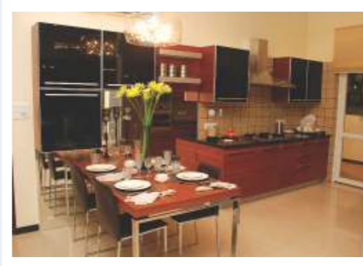
Italian Modular Kitchen with Panic Button (Add-on feature)