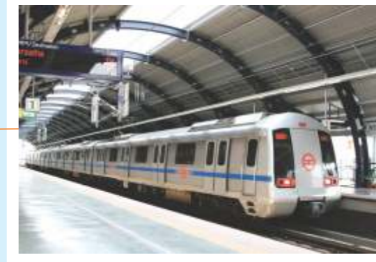
Near by Metro Station Soon