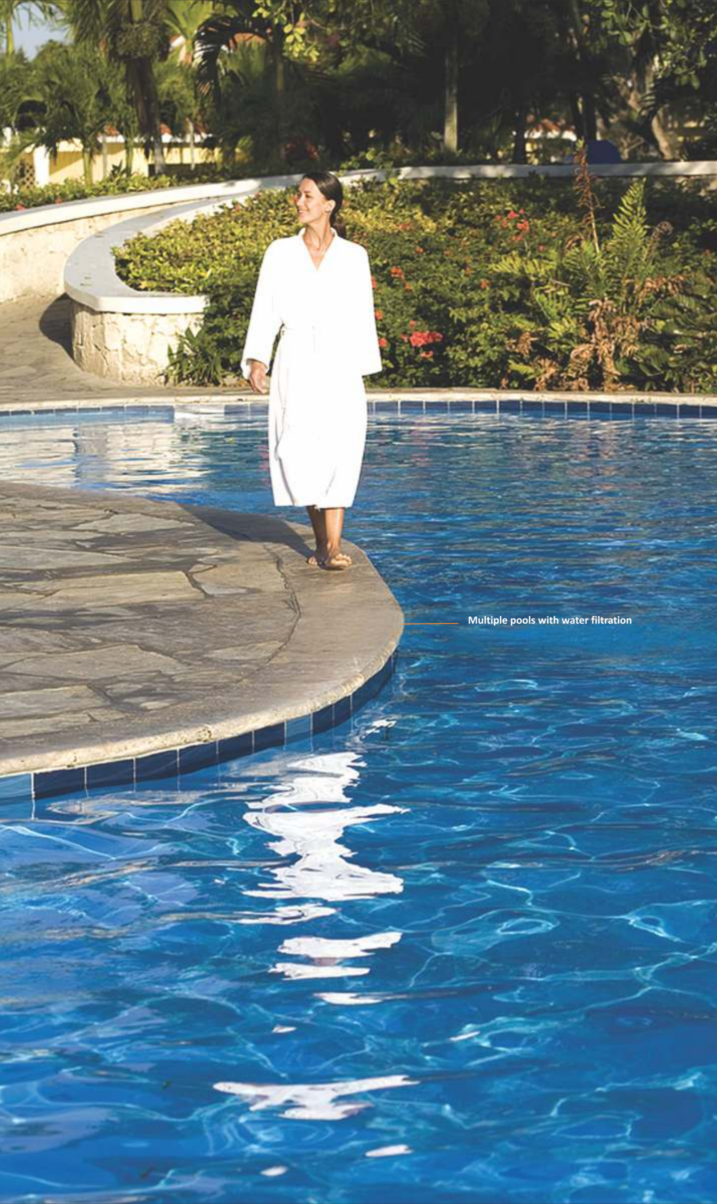
Multiple pools with water filtration