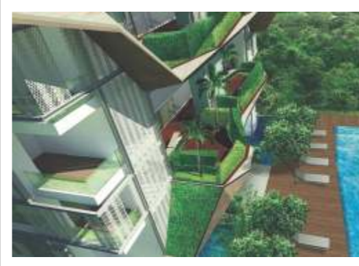
Sky gardens, terrace gardens, central lawn, Shaded Pergolas (75% open area)