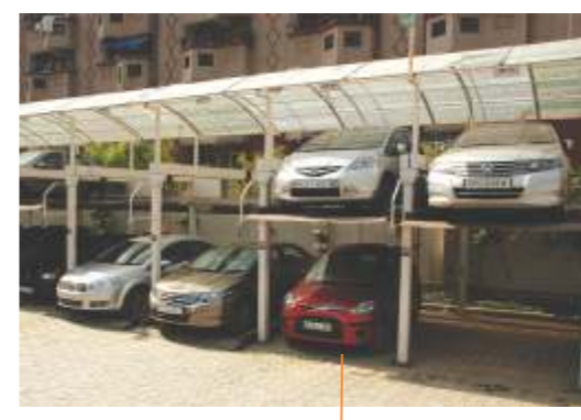
Automated Car Parking (Future provision)