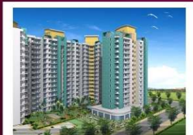
SG HOMES, Vasundhara (Construction in full swing)