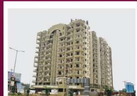
Impressions 58, Rajnagar Extn., Ghaziabad (Possession handed over)