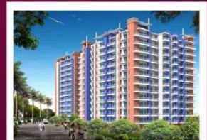
Indigo & Ivory Tower (SG Impression 58, Ph-II) (Under Construction)