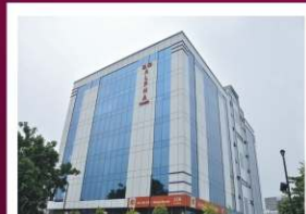
SG Alpha Tower, Vasundhara (Possession handed over)