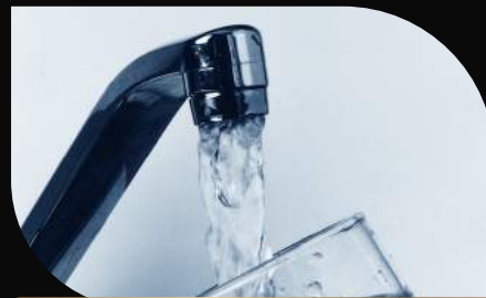
24x7 Water Supply