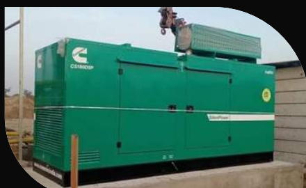
24x7 Power Backup