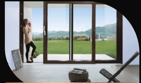
UPVC Door & Window