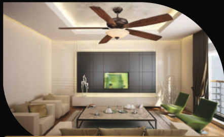
Fan & Lights