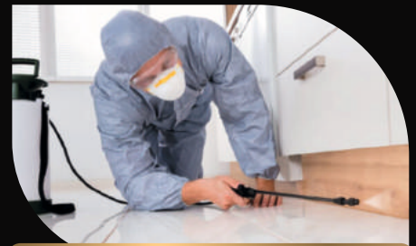
Anti Termite Treatment