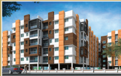
Bhawani Sun Valley Jawpur, Dum Dum (135 flats)