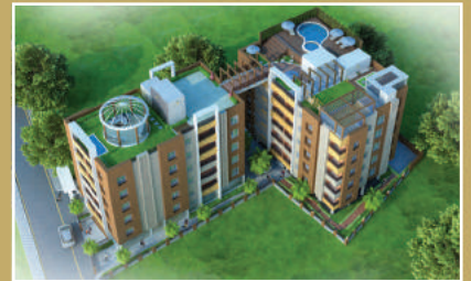
Bhawani Exotica Lake Town (35 flats)