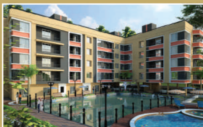
Bhawani Lake View Birati (33 flats)