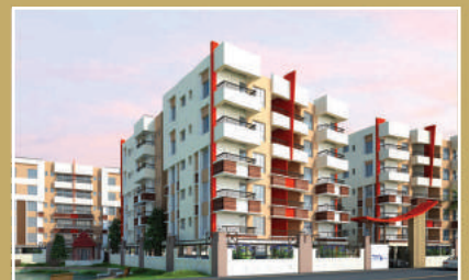
Bhawani Dreams Dum Dum Cantonment (150 flats)