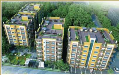
Bhawani Allen Enclave Kestopur (130 flats)