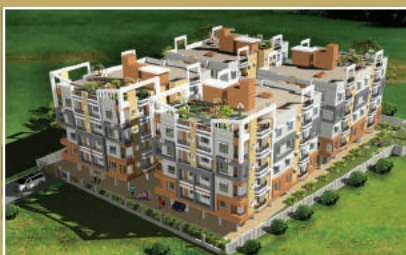
Bhawani North View Baguiati (108 flats)