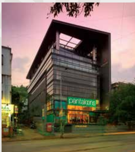
ACHALARE HOUSE Baner

With its thoughtfully crafted projects at Pune's most developed and most promising locations, Achalare Realtors has delivered 20+ residential and commercial projects till date. The journey to deliver 'you-friendly living' continues with passion.