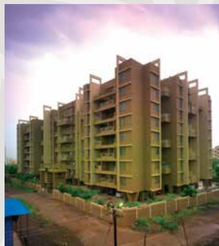
CITRINE 1 and 2 BHK Homes, Hinjawadi