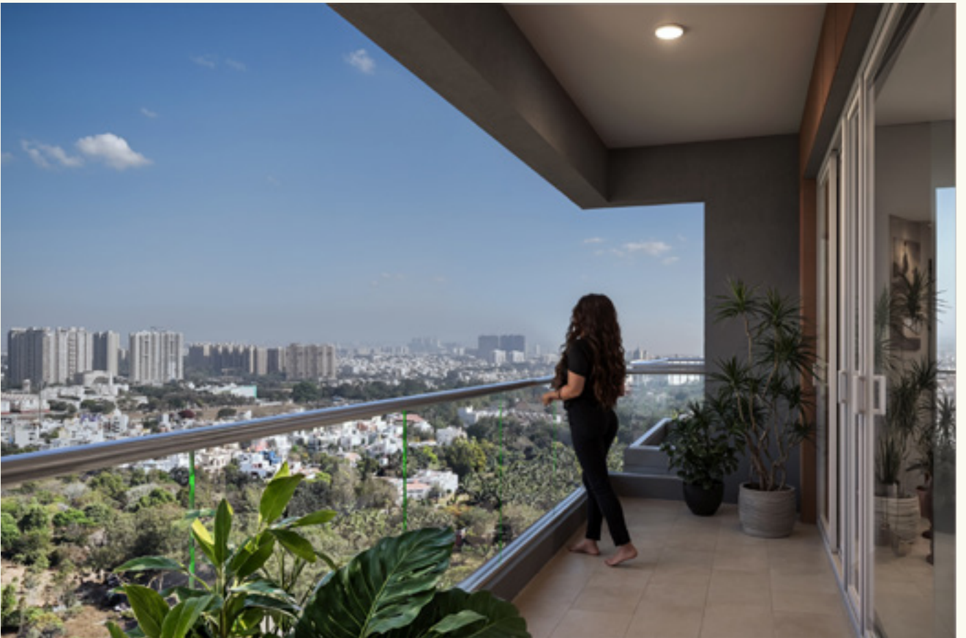
Fresh air, open skies, and nowhere else to be.