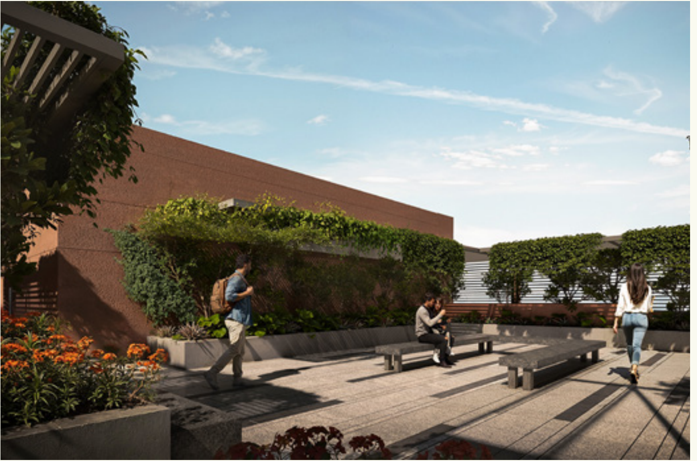
Where the city stretches out, and the day slows down.