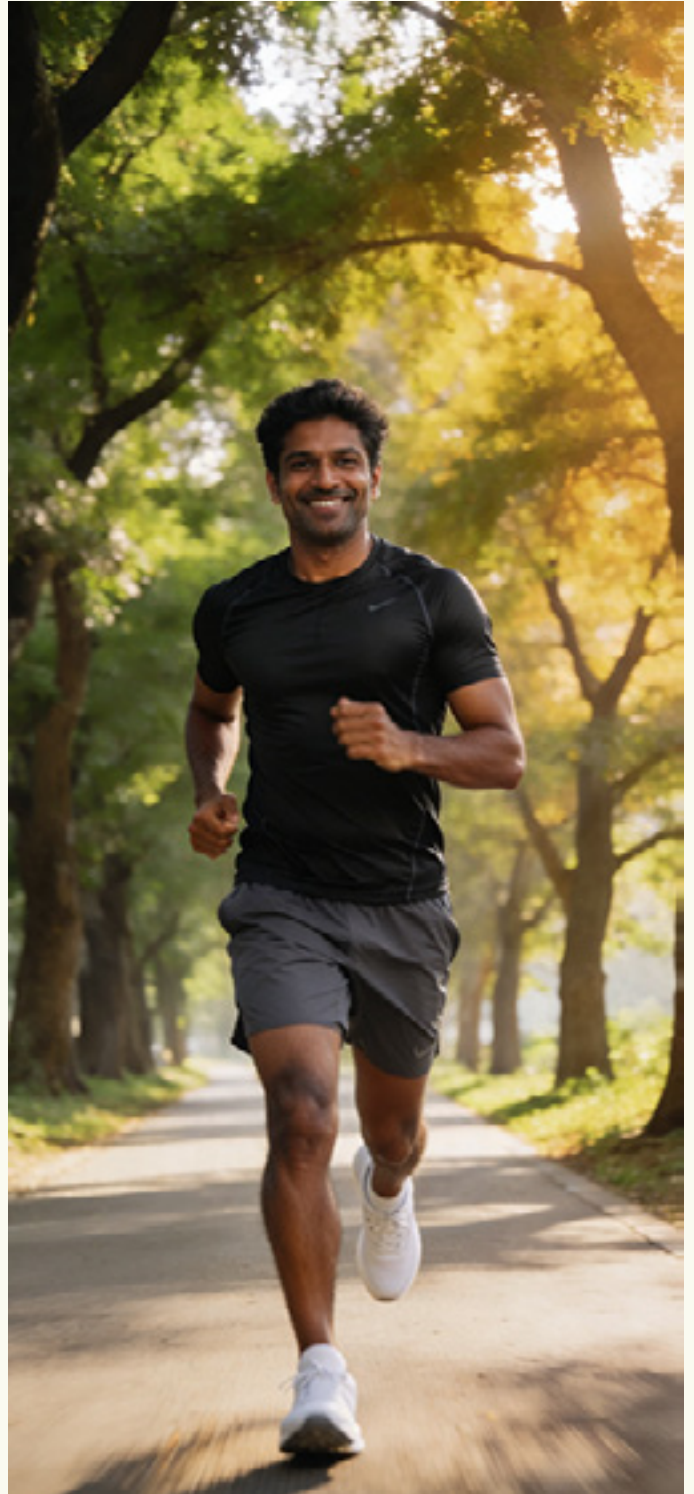
FOR NATURE ENTHUSIASTS Walking tracks, lush green spaces, and fresh air daily.