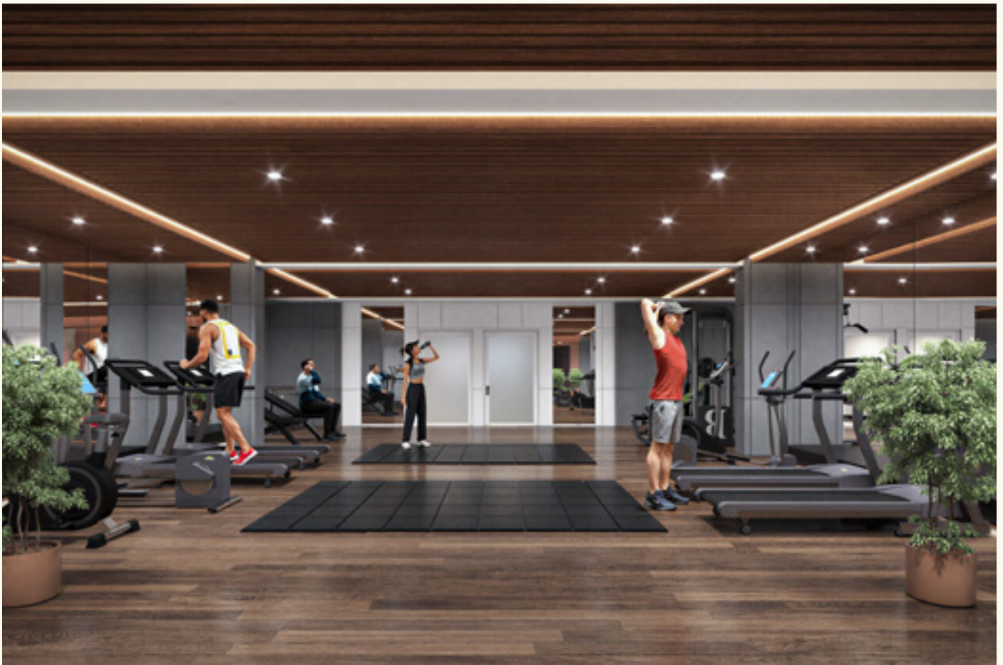
An air-conditioned fitness centre equipped for every goal.