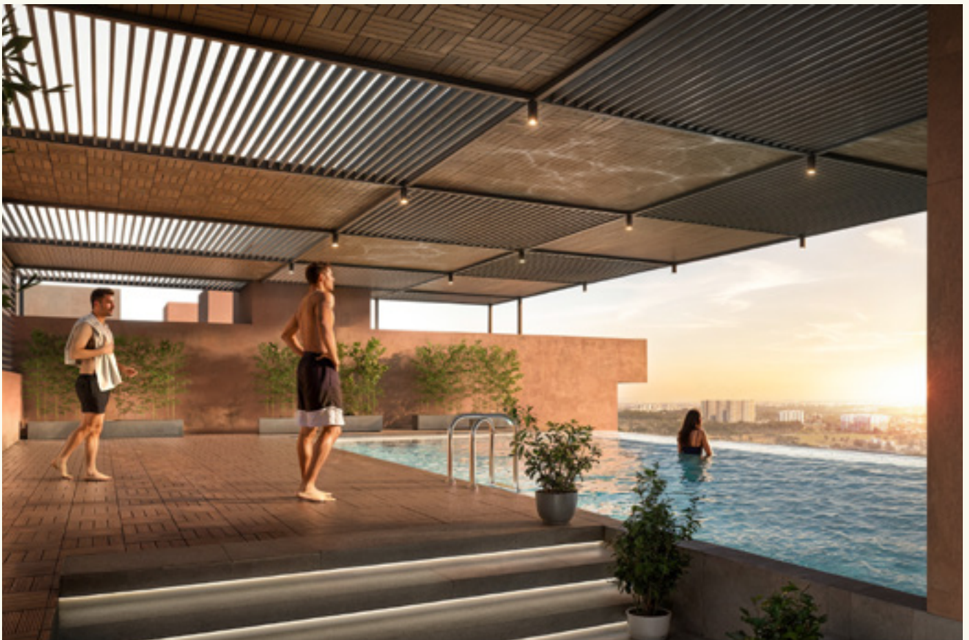
Above the city a semi-covered pool with pergola offering a resort-style retreat.