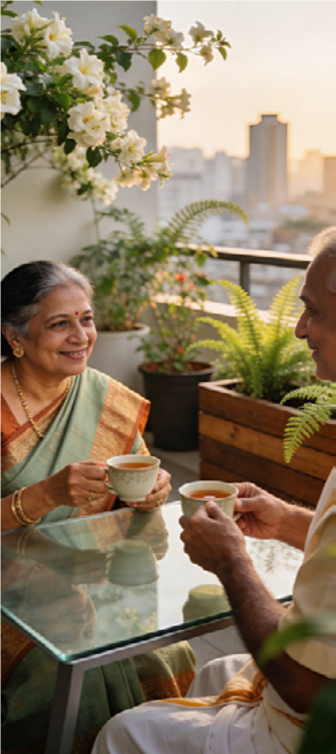
FOR SENIOR CITIZENS Designed for comfort, well-being, and community living.