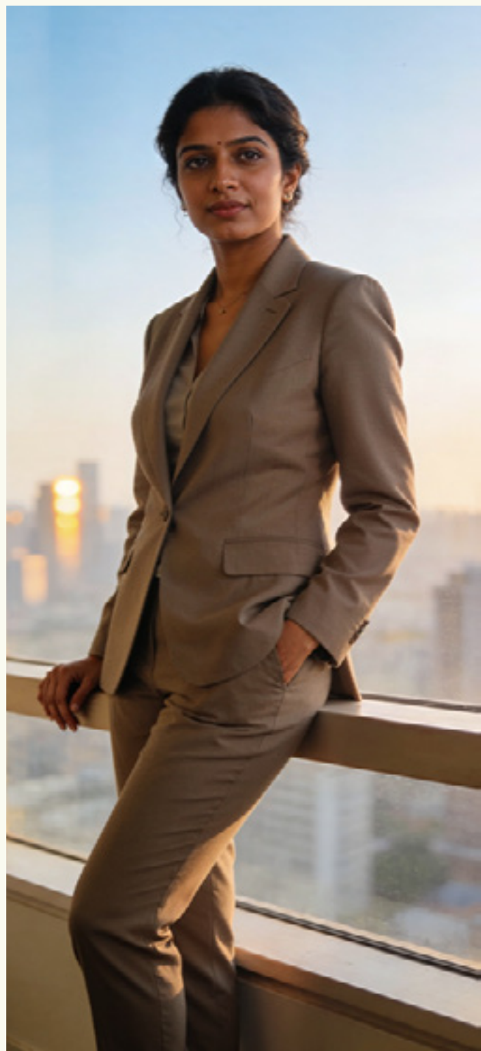
FOR PROFESSIONALS Peaceful retreat with excellent connectivity to city and airport.