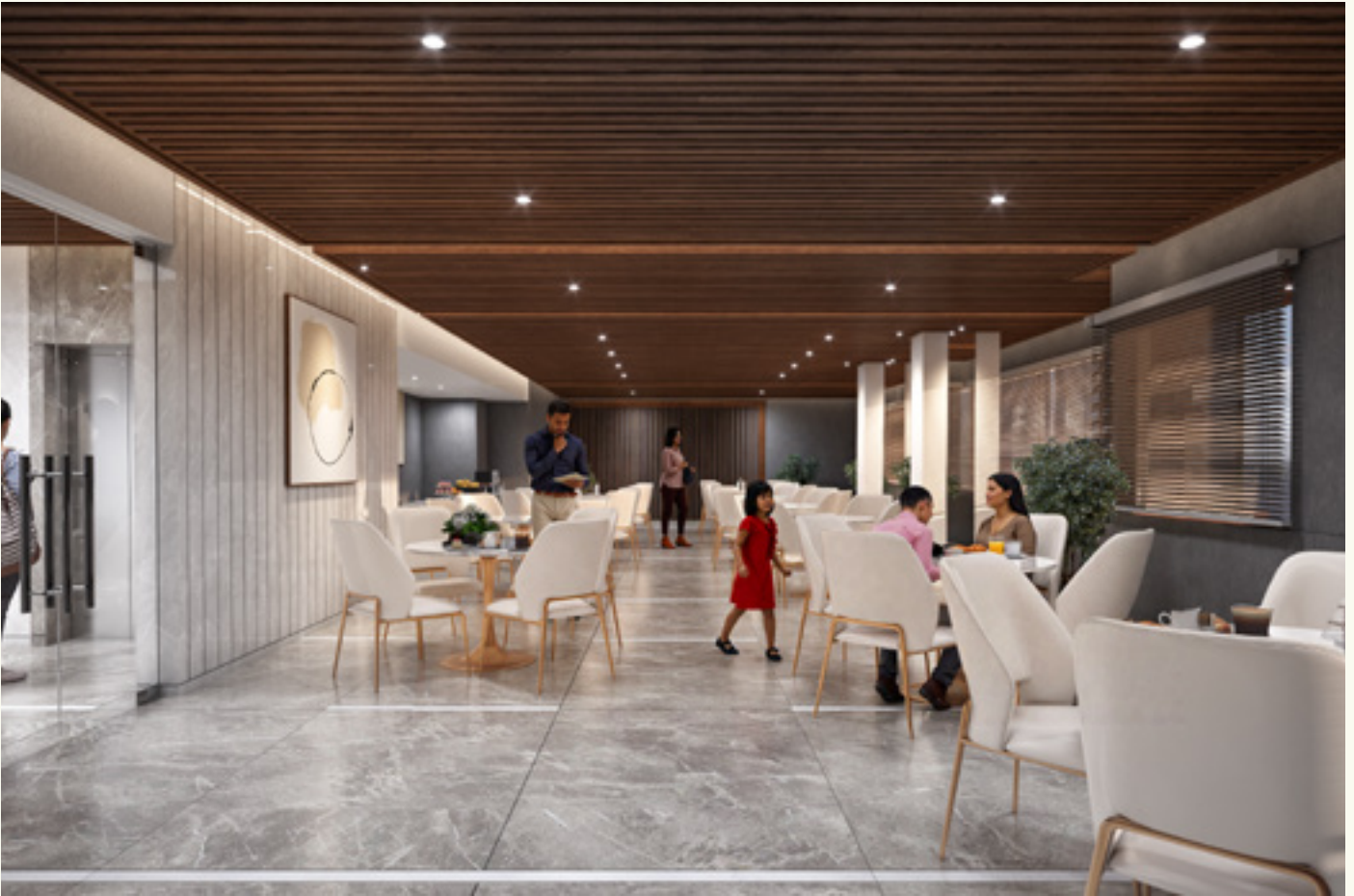
Where neighbours become a community.