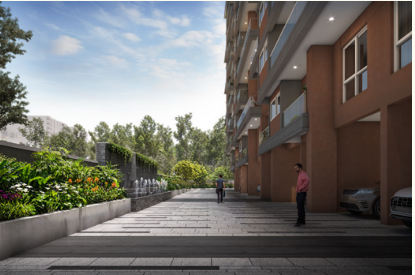
Thoughtfully planned spaces.