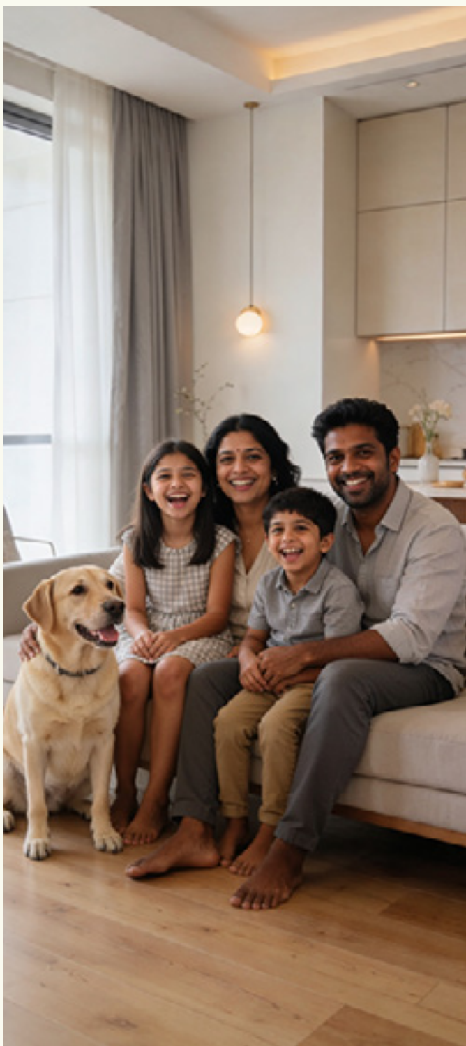
FOR FAMILIES Expansive spaces, kids' play areas, and pet-friendly zones.