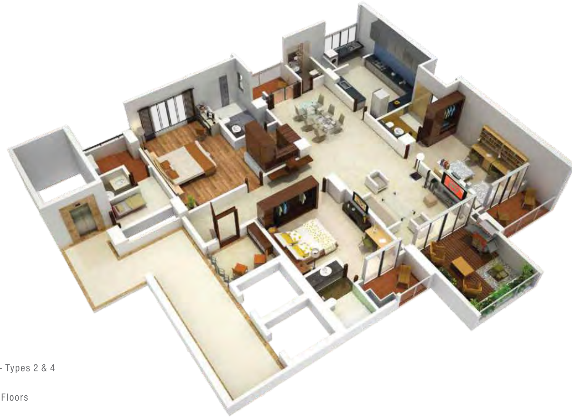
3 BHK Unit - Types 2 & 4 3035 sq. ft. 3rd to 29th Floors