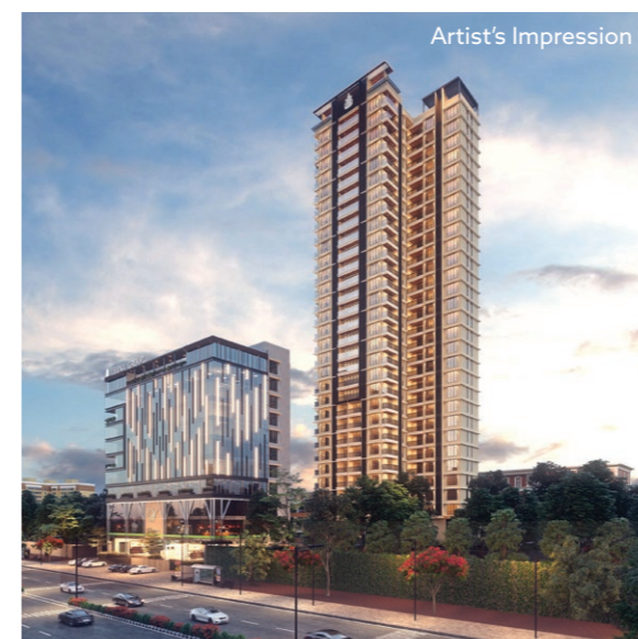
Imperial Residency - Ongoing