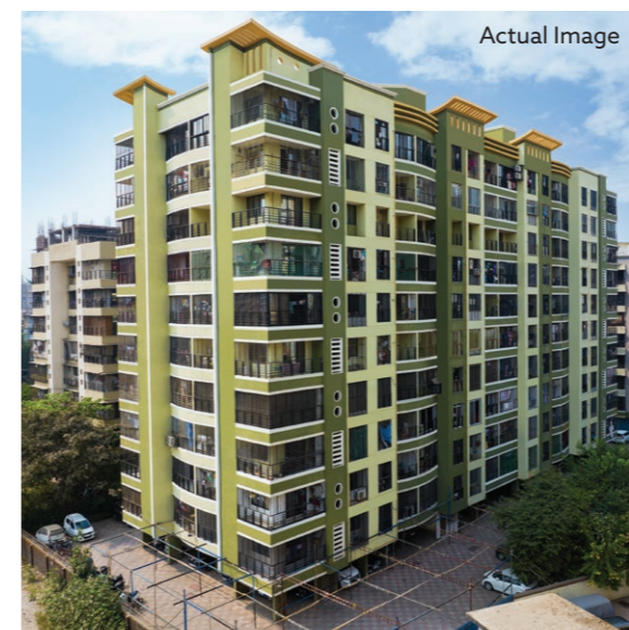
Bhairav Shrushti - 2007