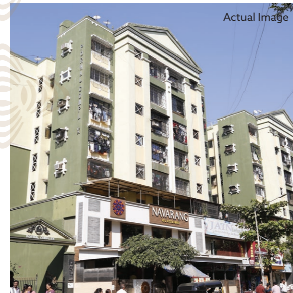
Porwal Complex - 1995