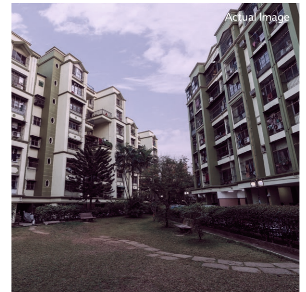
Gaurav Garden Complex - 1999