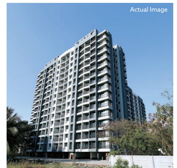
Bhairav Residency - 2012