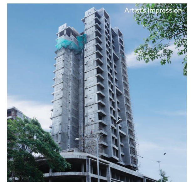
Bhairav Enclave - Ongoing