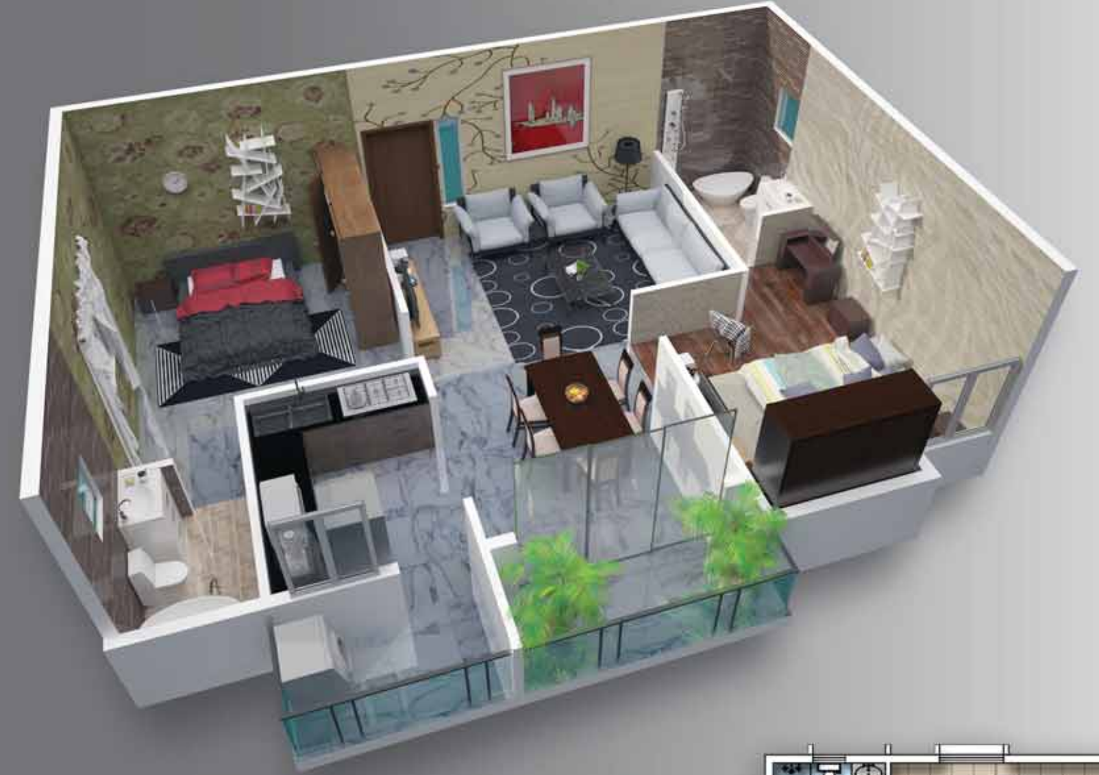
2 BHK - 1054 Sq. Ft.