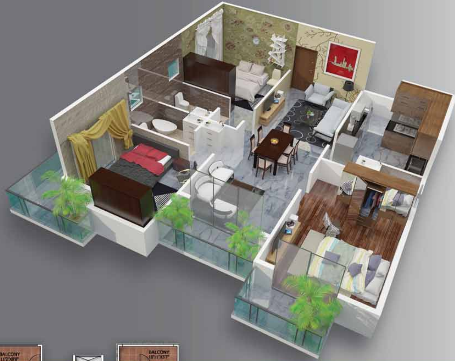
3 BHK - 1611 Sq. Ft.