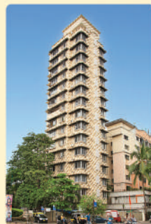
Riddhi Siddhi Tower, Tilak Nagar