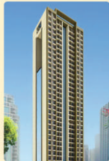
New Suraj Tower, Vartak Nagar