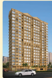
Ekdanta 24Karat, Nehru Nagar