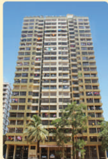
Siddhivinayak Tower, Vartak Nagar