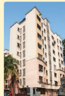
Khushi Tower, Tilak Nagar