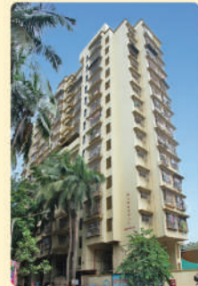
Datta krupa Heights, Nehru Nagar