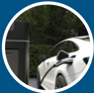
EV- Charge Provision