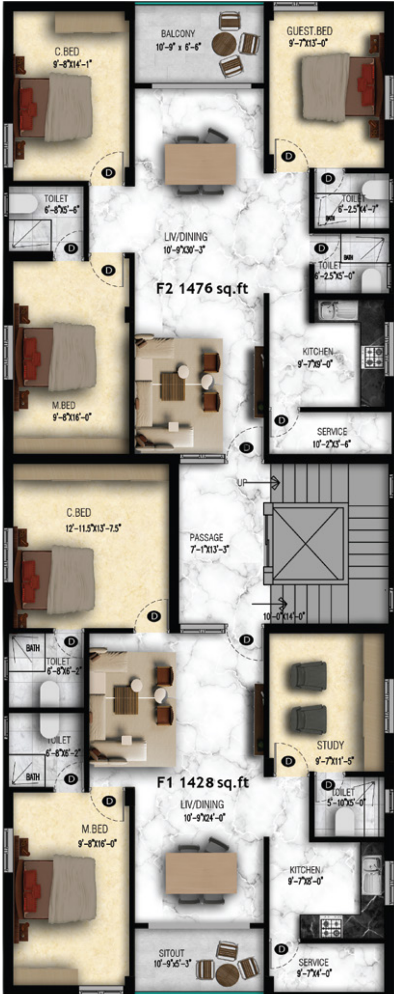
F2 1476 sq.ft