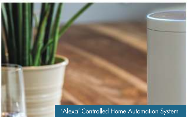
'Alexa' Controlled Home Automation System