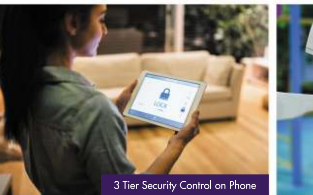
3 Tier Security Control on Phone