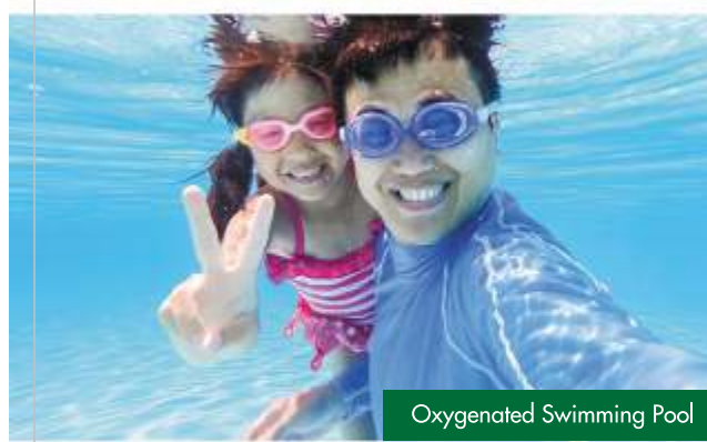
Oxygenated Swimming Pool