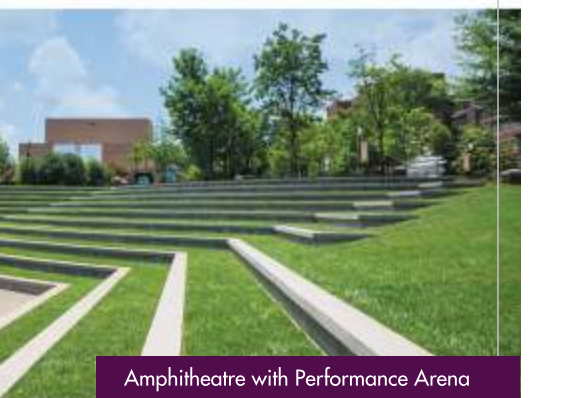
Amphitheatre with Performance Arena