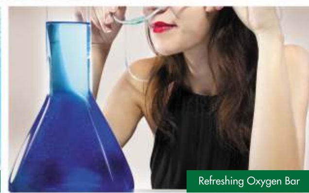
Refreshing Oxygen Bar