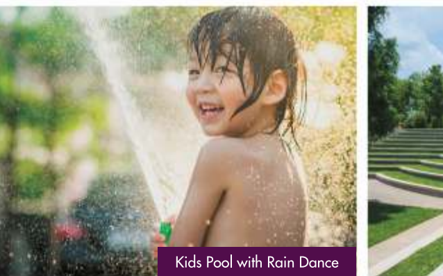
Kids Pool with Rain Dance