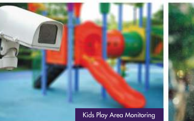
Kids Play Area Monitoring