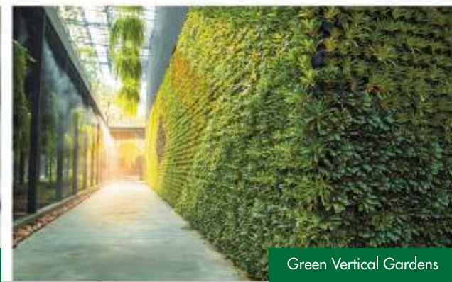
Green Vertical Gardens