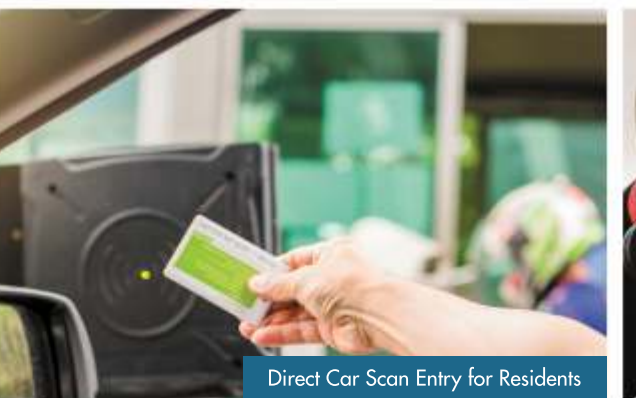
Direct Car Scan Entry for Residents