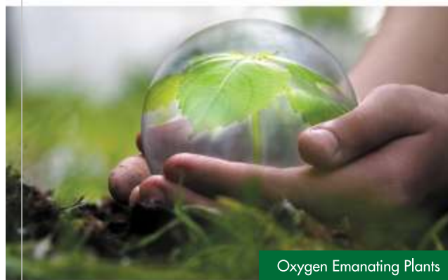
Oxygen Emitting Plants