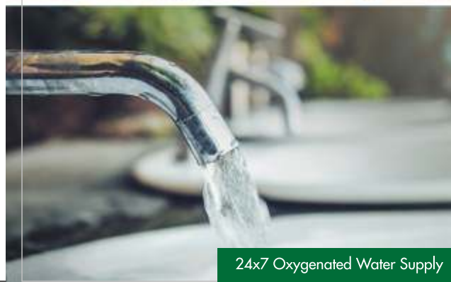
24x7 Oxygenated Water Supply