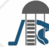
TODDLERS PLAY AREA