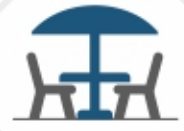
ROOF TOP SITTING