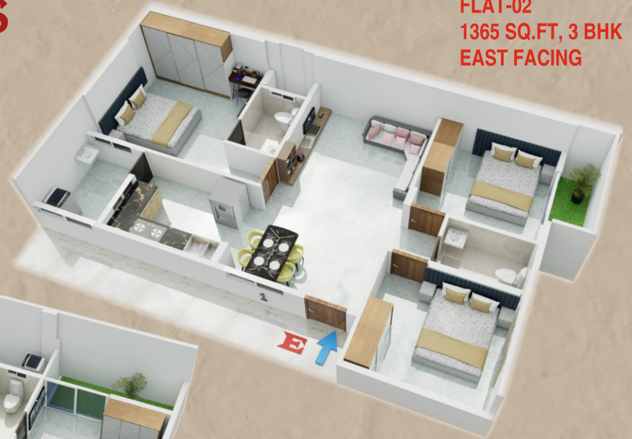
FLAT-02 1365 SQ.FT, 3 BHK EAST FACING