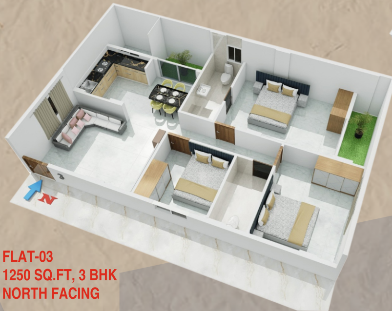
FLAT-03 1250 SQ.FT, 3 BHK NORTH FACING