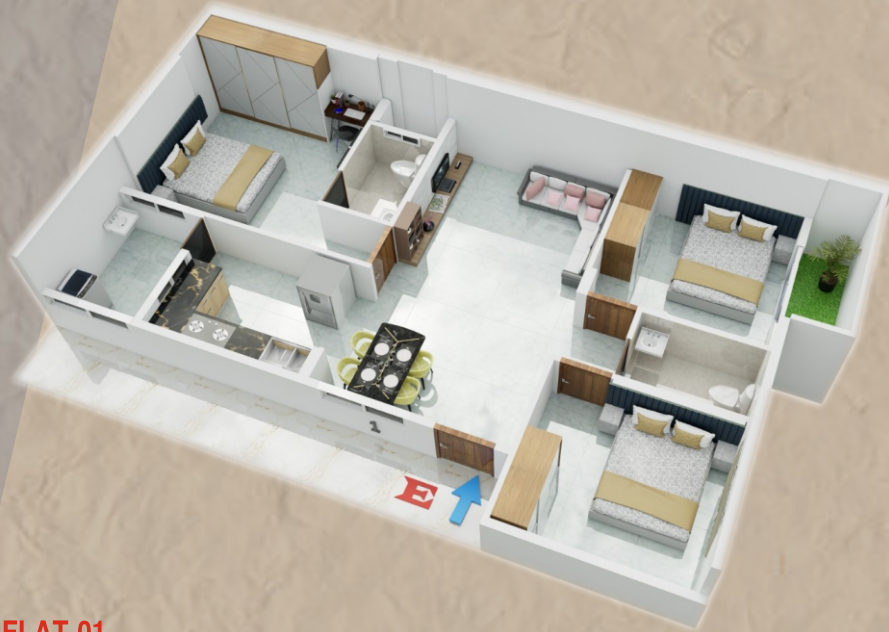
FLAT-01 1390 SQ.FT, 3 BHK EAST FACING