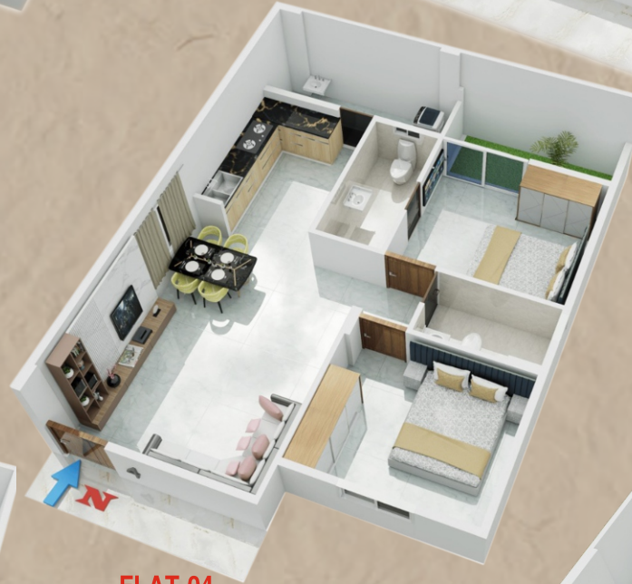
FLAT-04 1015 SQ.FT, 2 BHK NORTH FACING