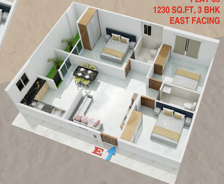
FLAT-05 1230 SQ.FT, 3 BHK EAST FACING