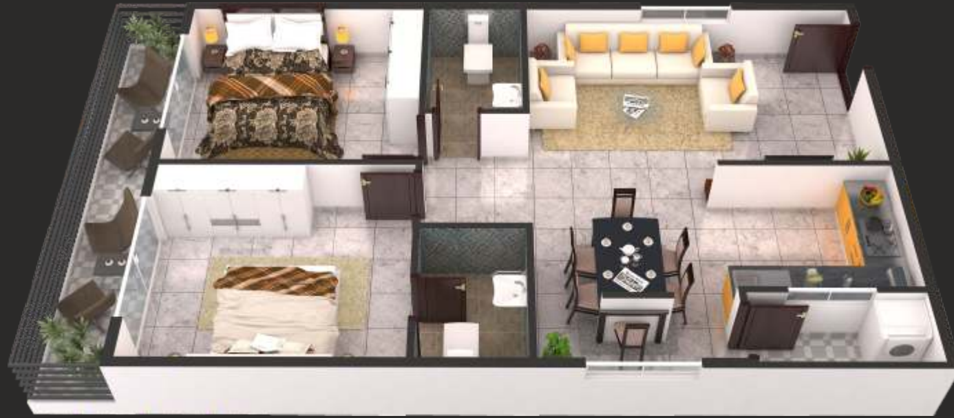
C2 - 2BHK - East Facing 1250sft