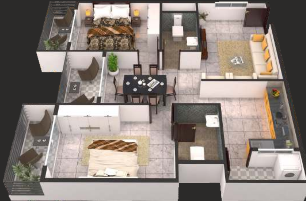
A3 - 2BHK - East Facing 1245sft