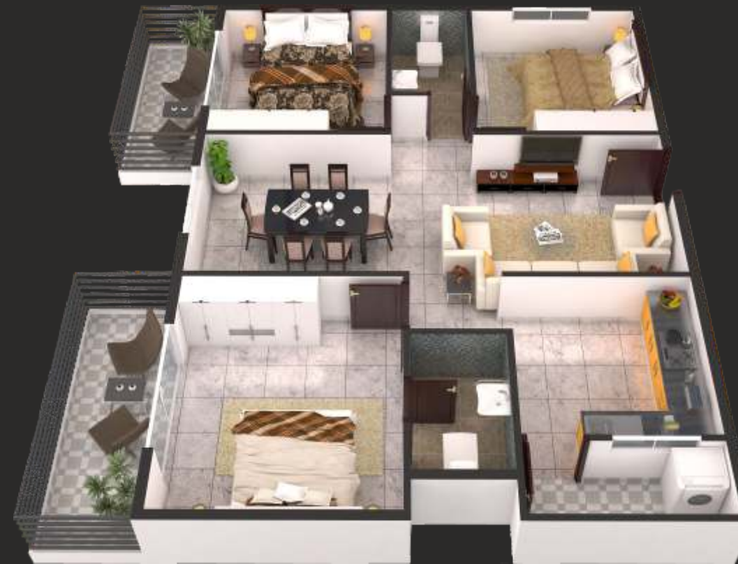
D1 - 2.5BHK - East Facing 1400sft