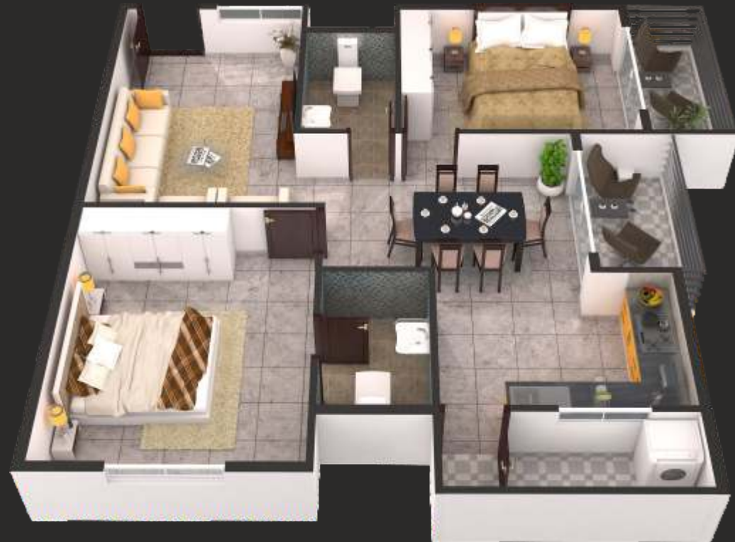
A6 - 2BHK - North Facing 1255sft