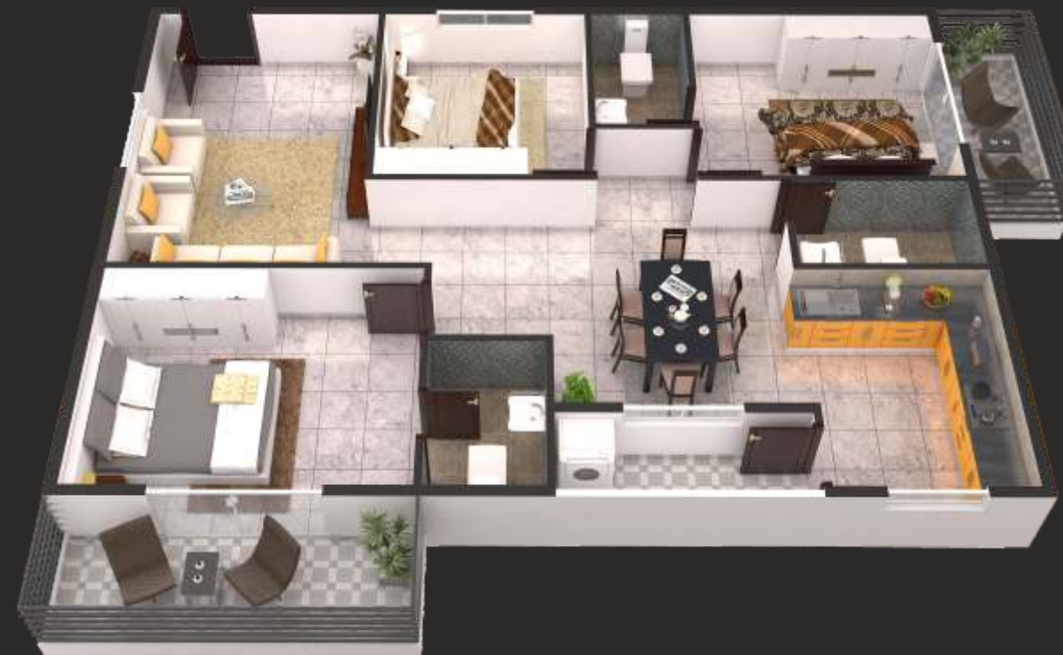
A8 - 3BHK - North Facing 1675sft