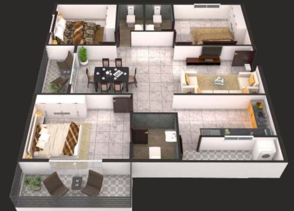
C1 - 3BHK - East Facing 1685sft