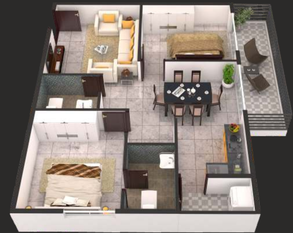
D4 - 2BHK - West Facing 1110sft