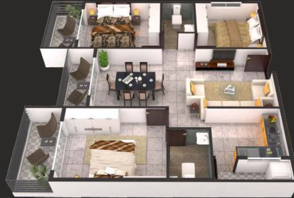
C4 - 2.5BHK - East Facing 1375sft