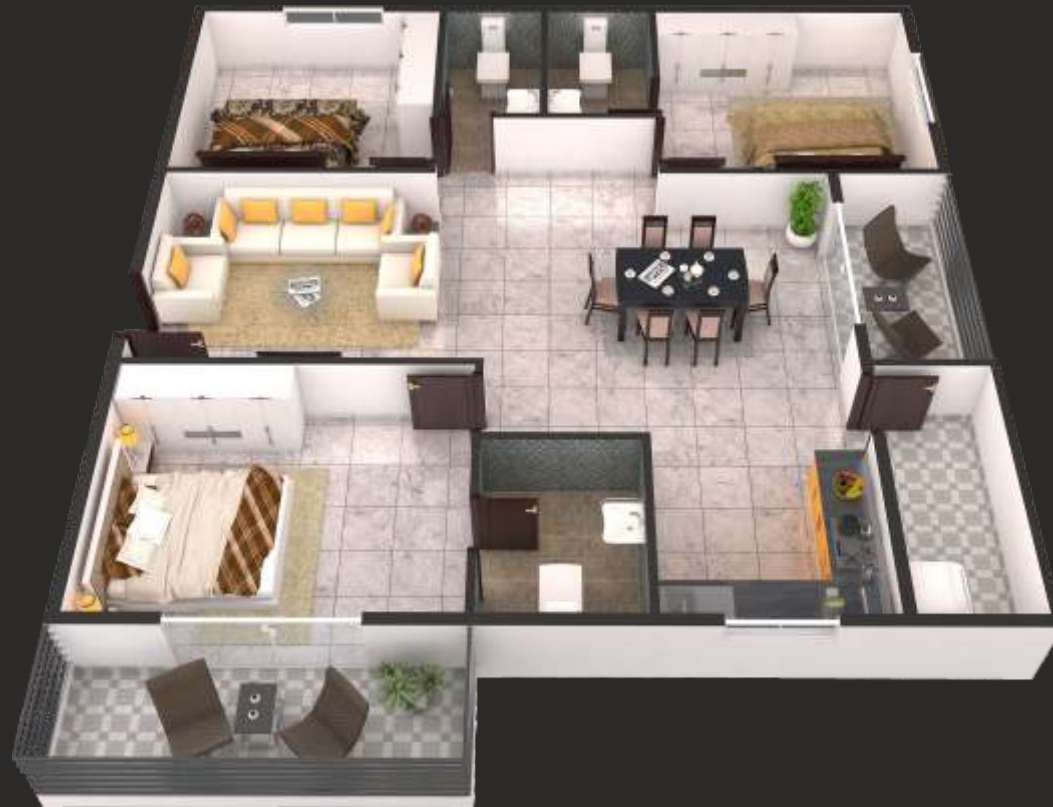
C8 - 3BHK - West Facing 1685sft