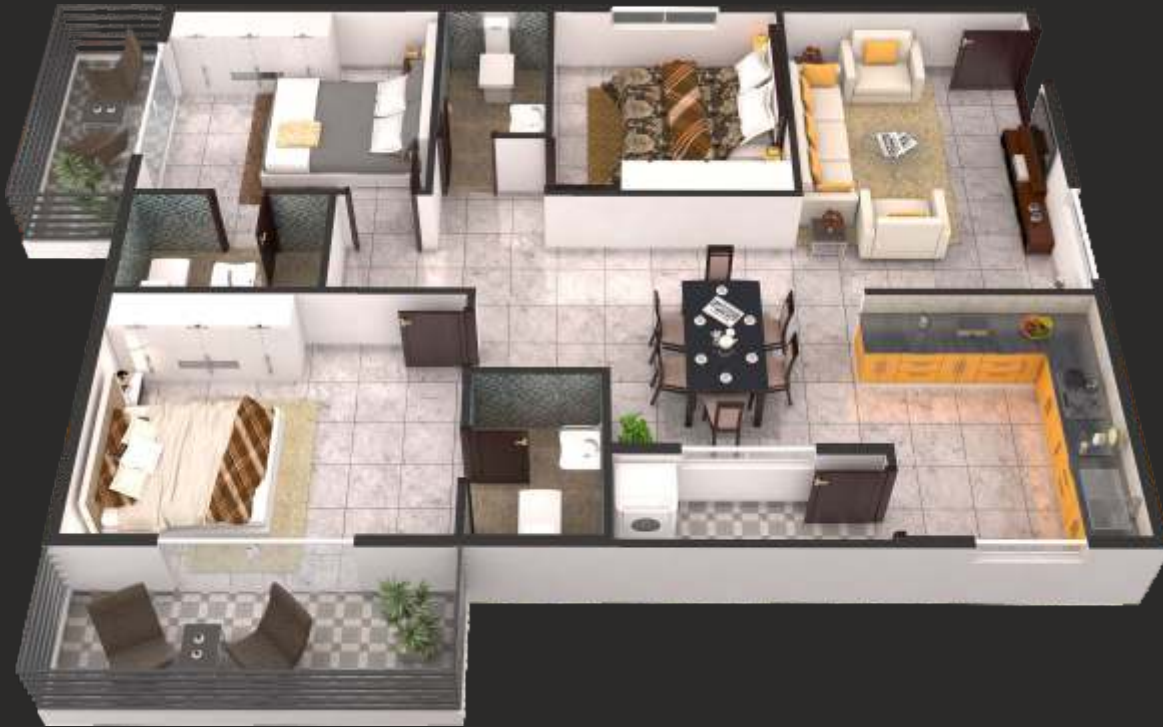
A1 - 3BHK - East Facing 1675sft