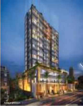
NIVAN Khar (West) RERA NO : P51800011423