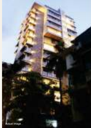
VOGUE Santacruz (West) OC & BCC Received