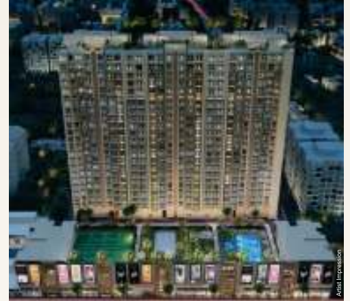
HUBTOWN PREMIERE Versova-Lokhandwala PROJECT RERA ID : MALIBU : P51800005224 BEVERLY : P51800002671 | BEL AIR : P51800005688