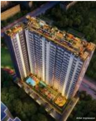
ANANDA RESIDENCY Borivali (West) RERA NO : P51800000204