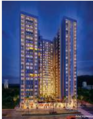
ARIANA RESIDENCY Borivali (East) RERA NO : P51800008691