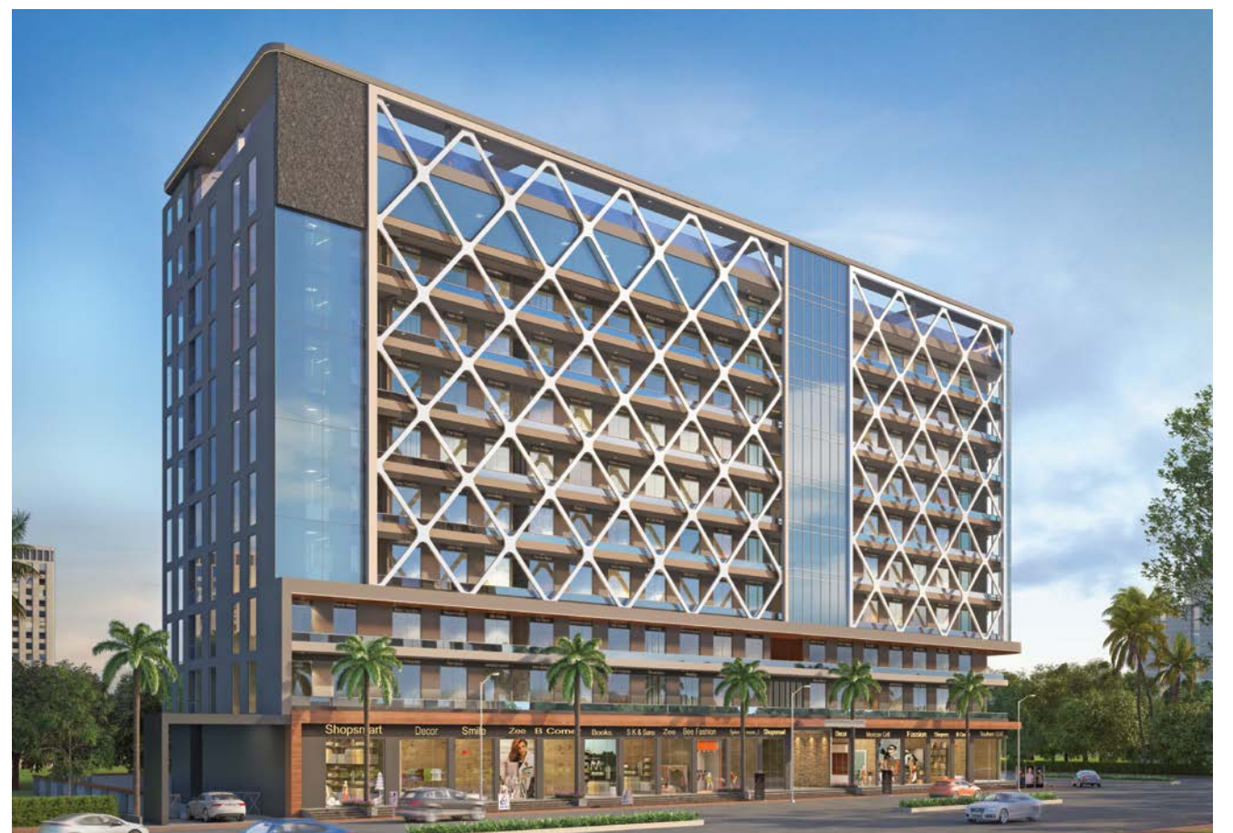
TRIAA VASANTAM CITY CENTER, DHANORI