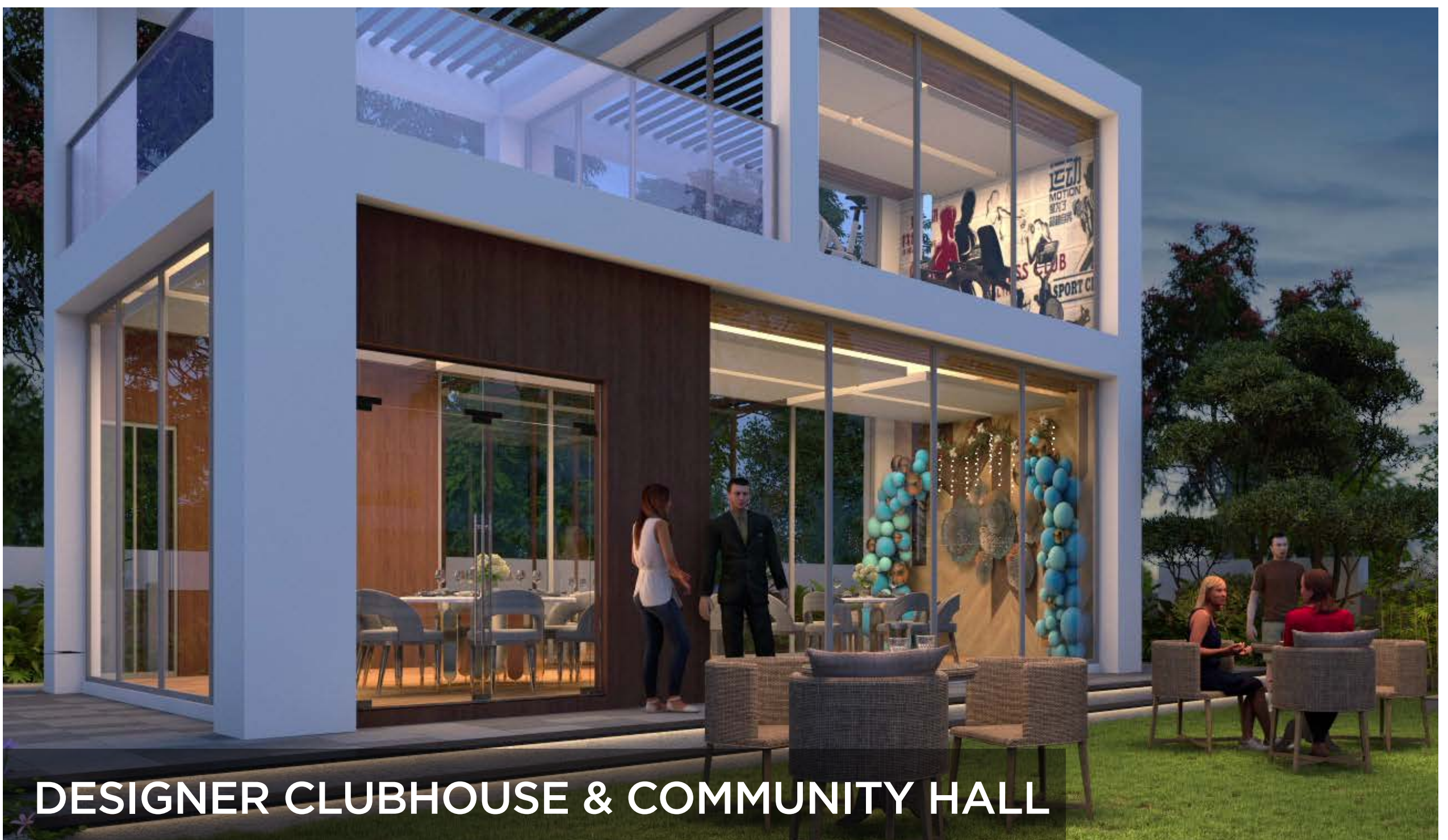
DESIGNER CLUBHOUSE & COMMUNITY HALL