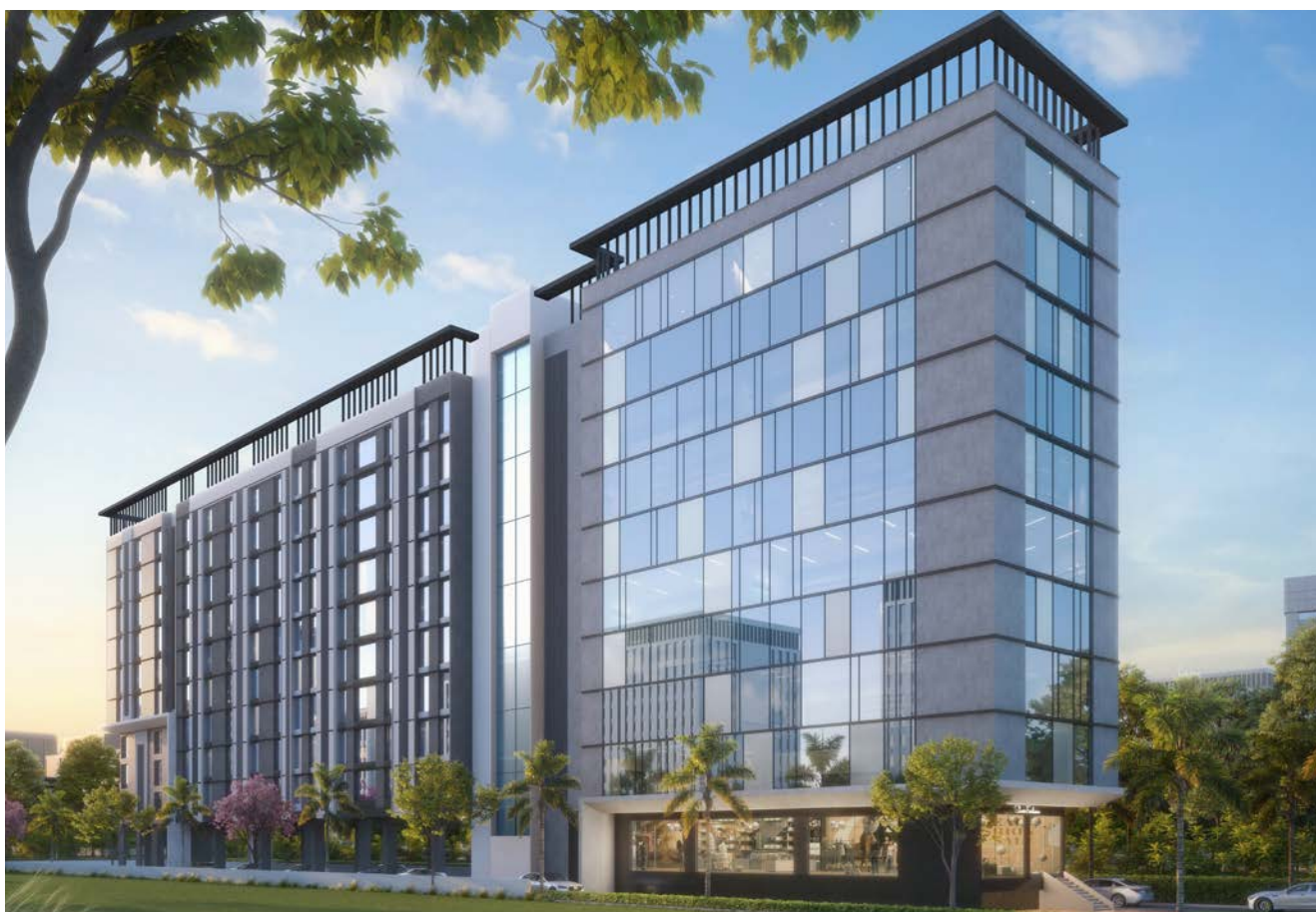
TRIAA GALAXY CITY CENTRE, HINJEWADI