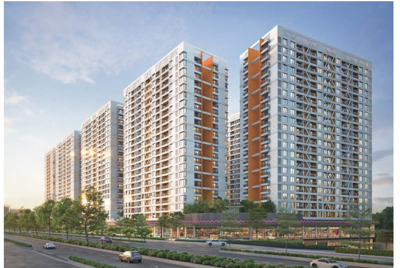
K PUNE, BAVDHAN