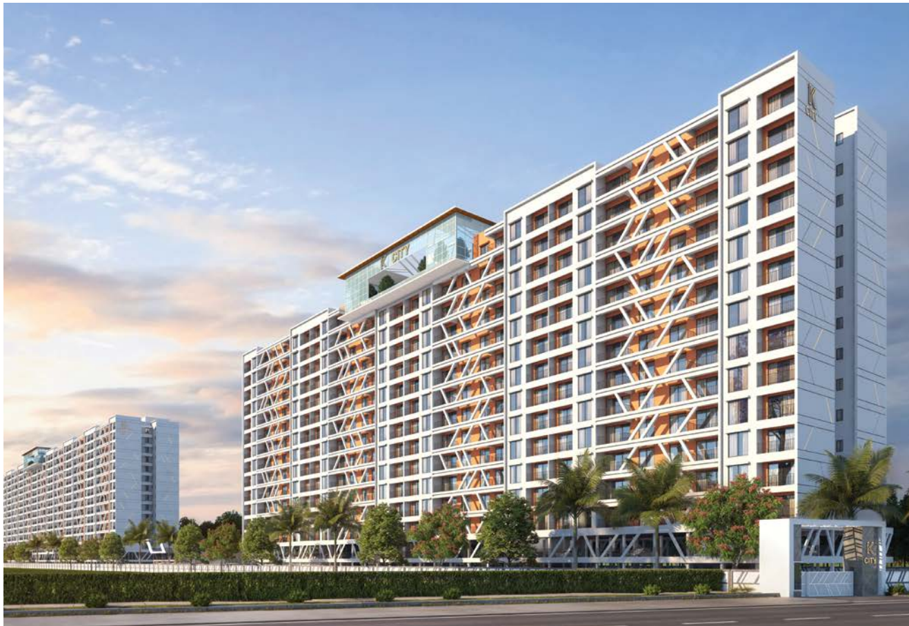
K CITY, KESHAV NAGAR