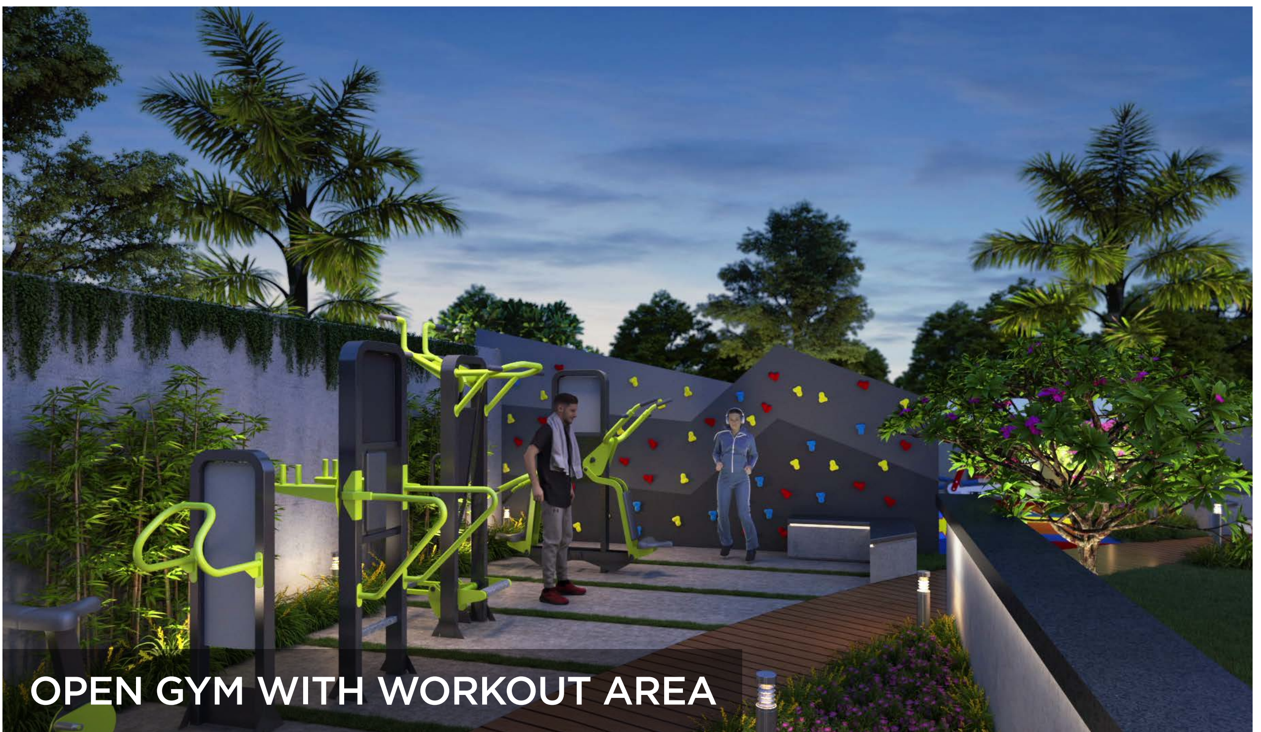
OPEN GYM WITH WORKOUT AREA