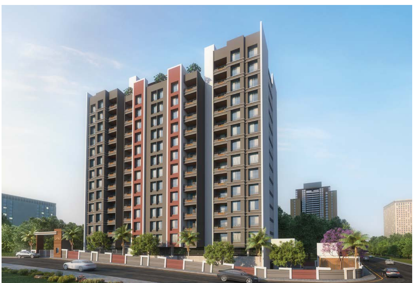
ELYSIA, KESHAV NAGAR