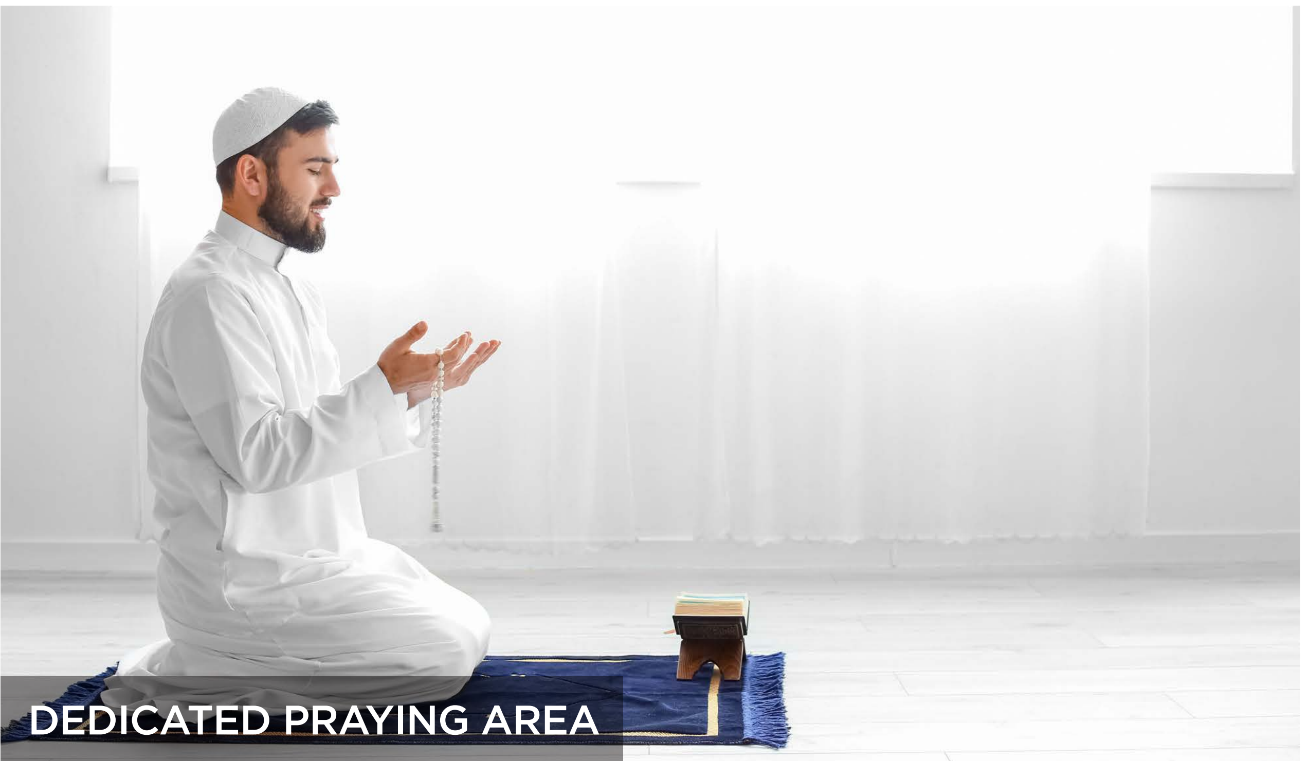
DEDICATED PRAYING AREA

Image for representational purposes only