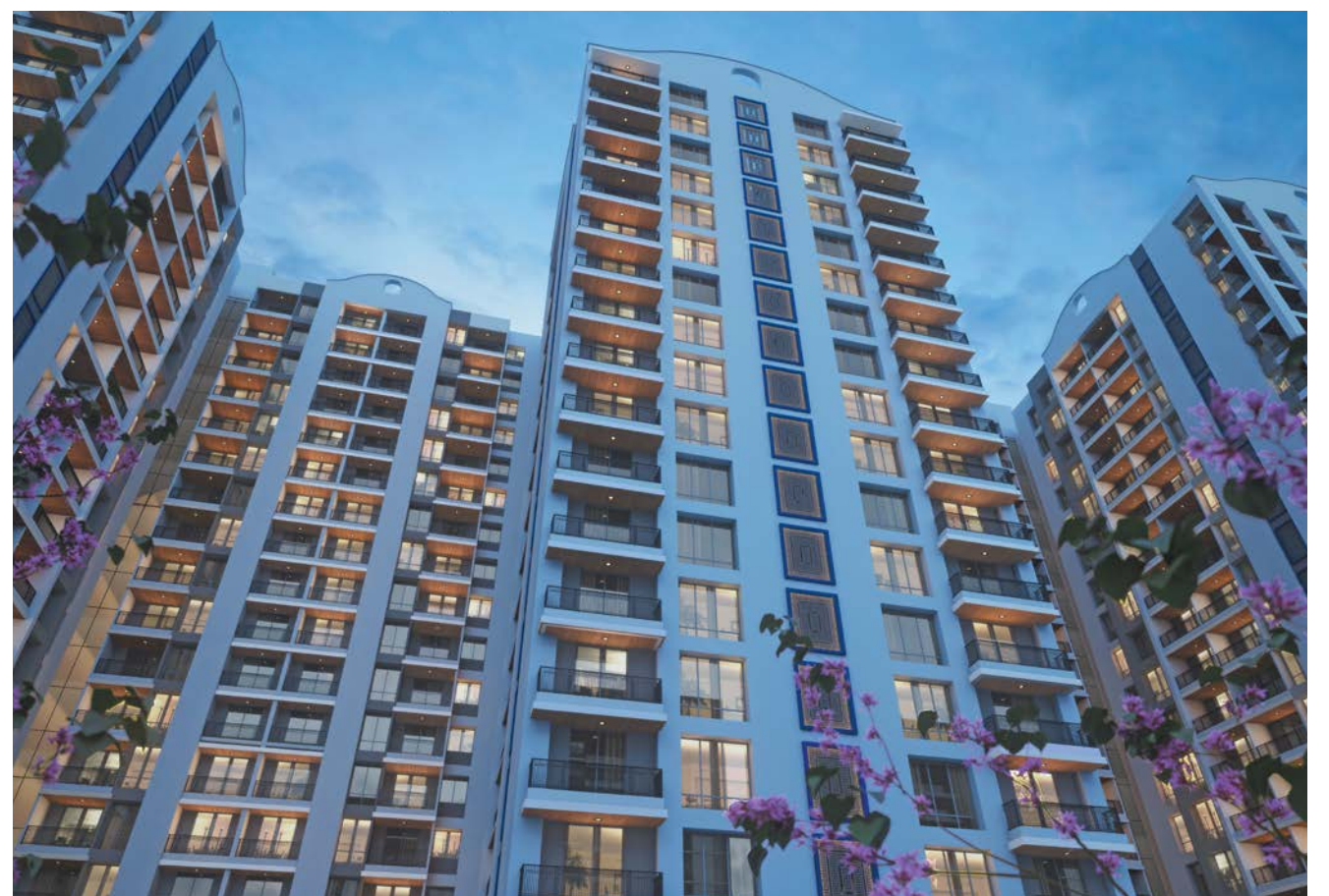
ONE ARETHA, DHANORI