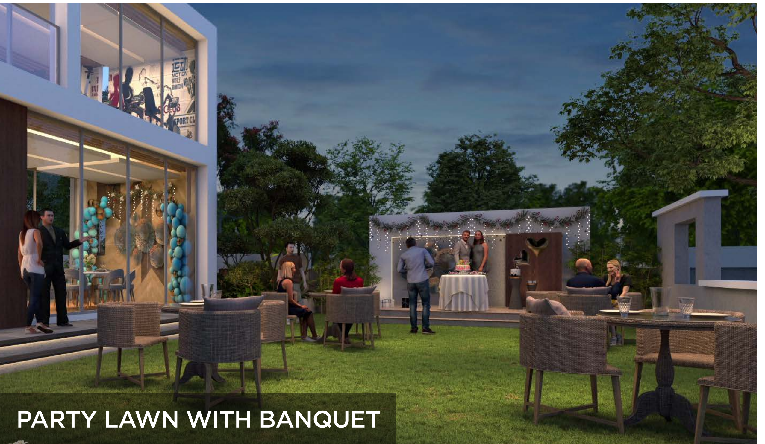
PARTY LAWN WITH BANQUET