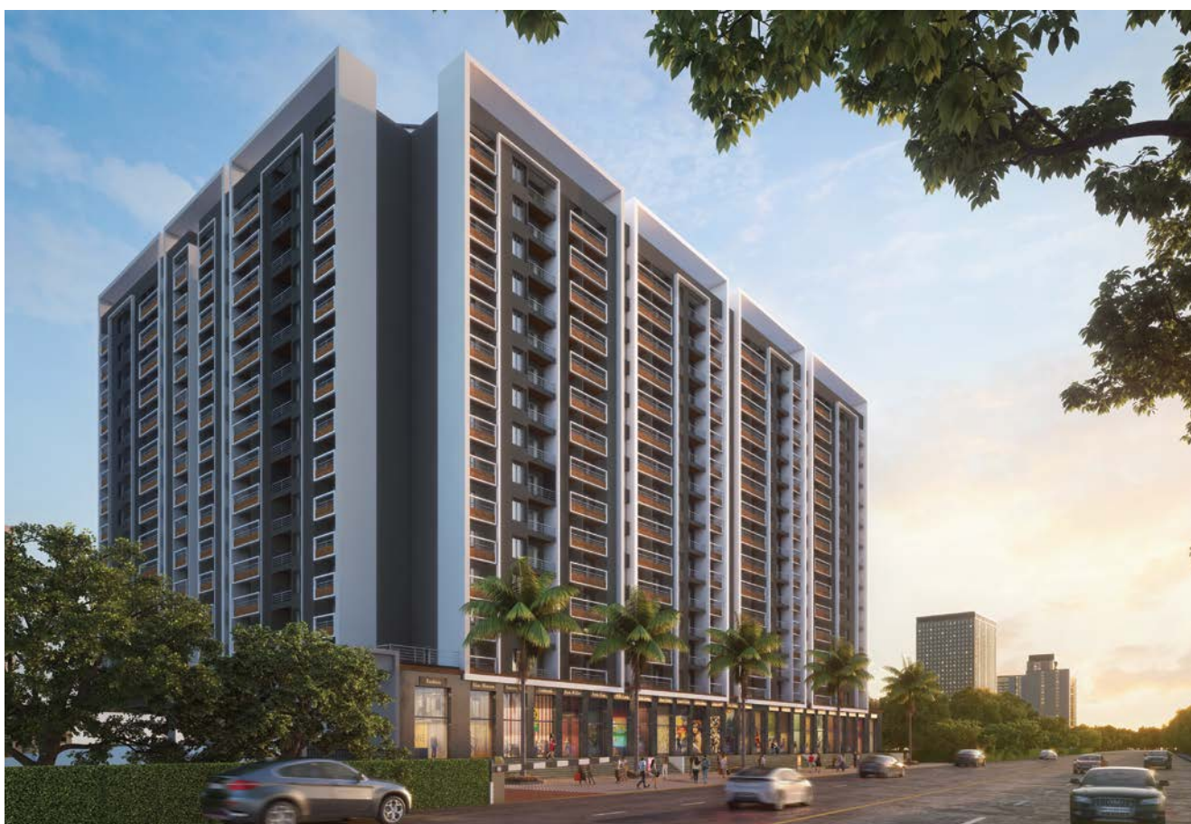
KOSMIC KOURTYARD, UPPER KHARADI