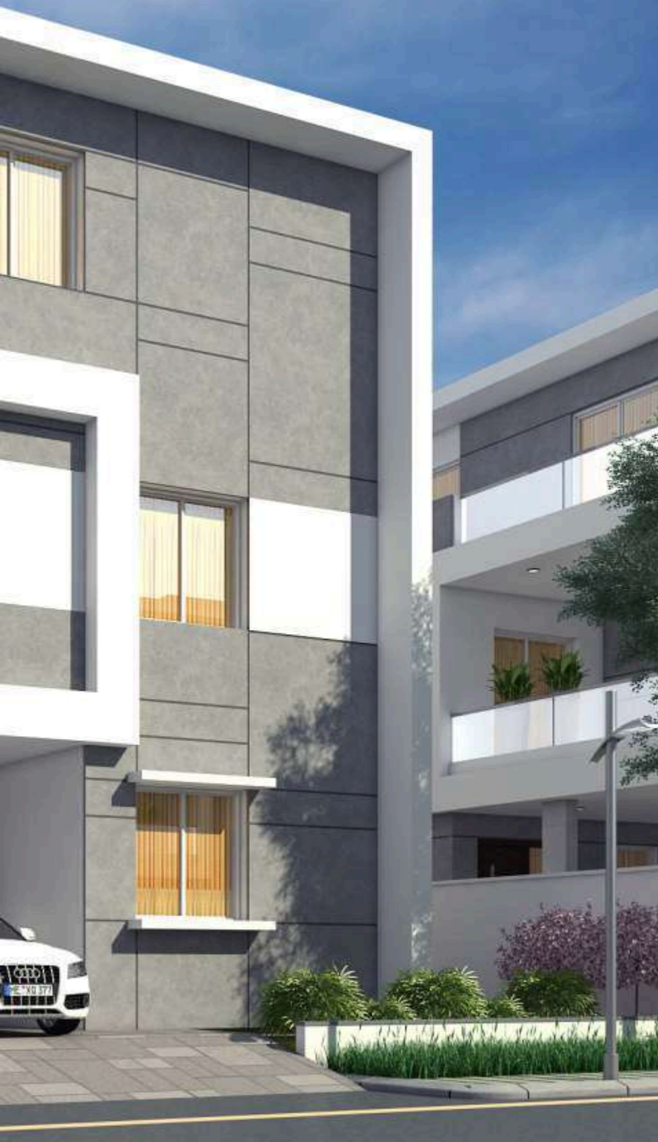
WEST FACE VIEW