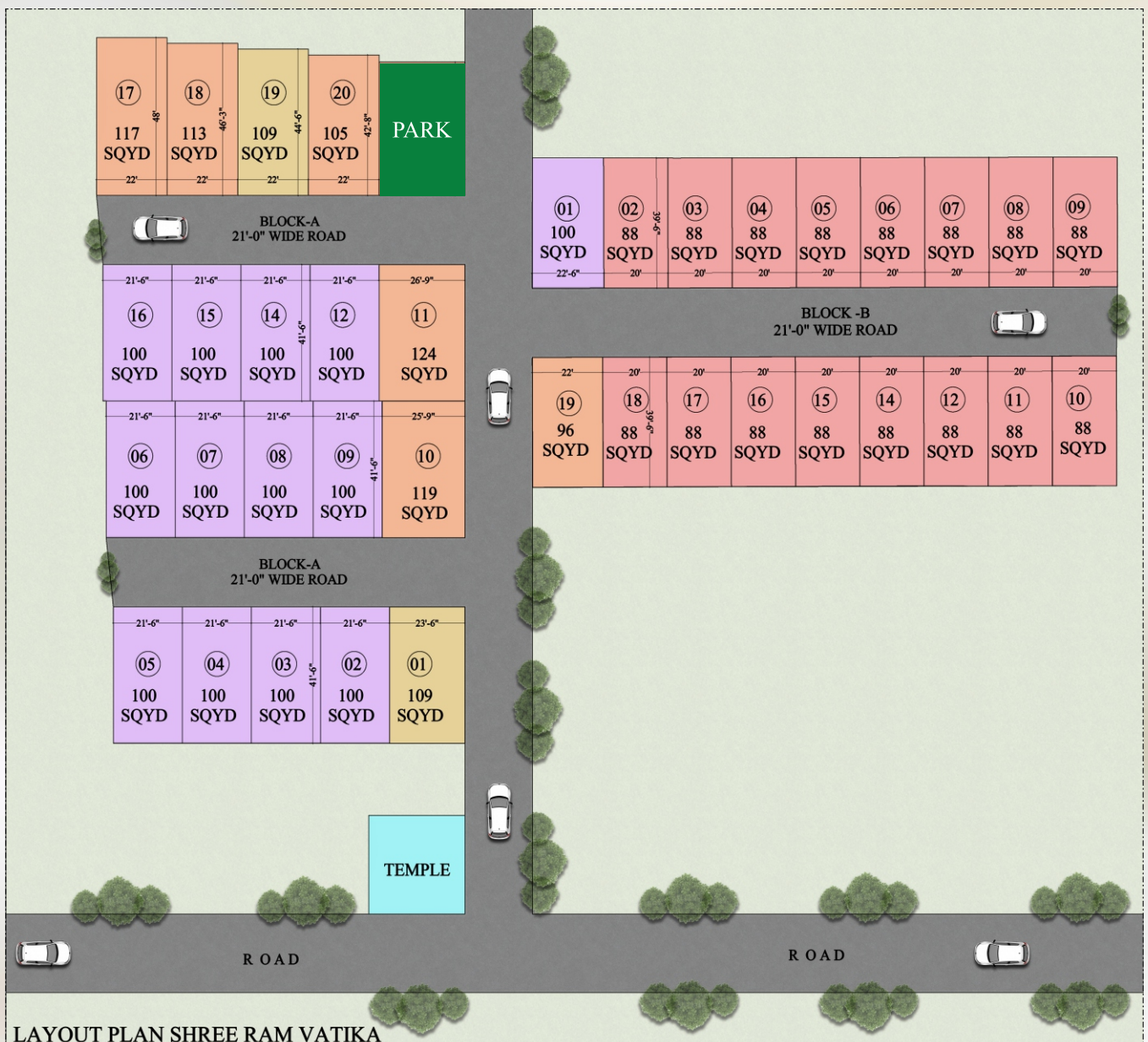
LAYOUT PLAN SHREE RAM VATIKA